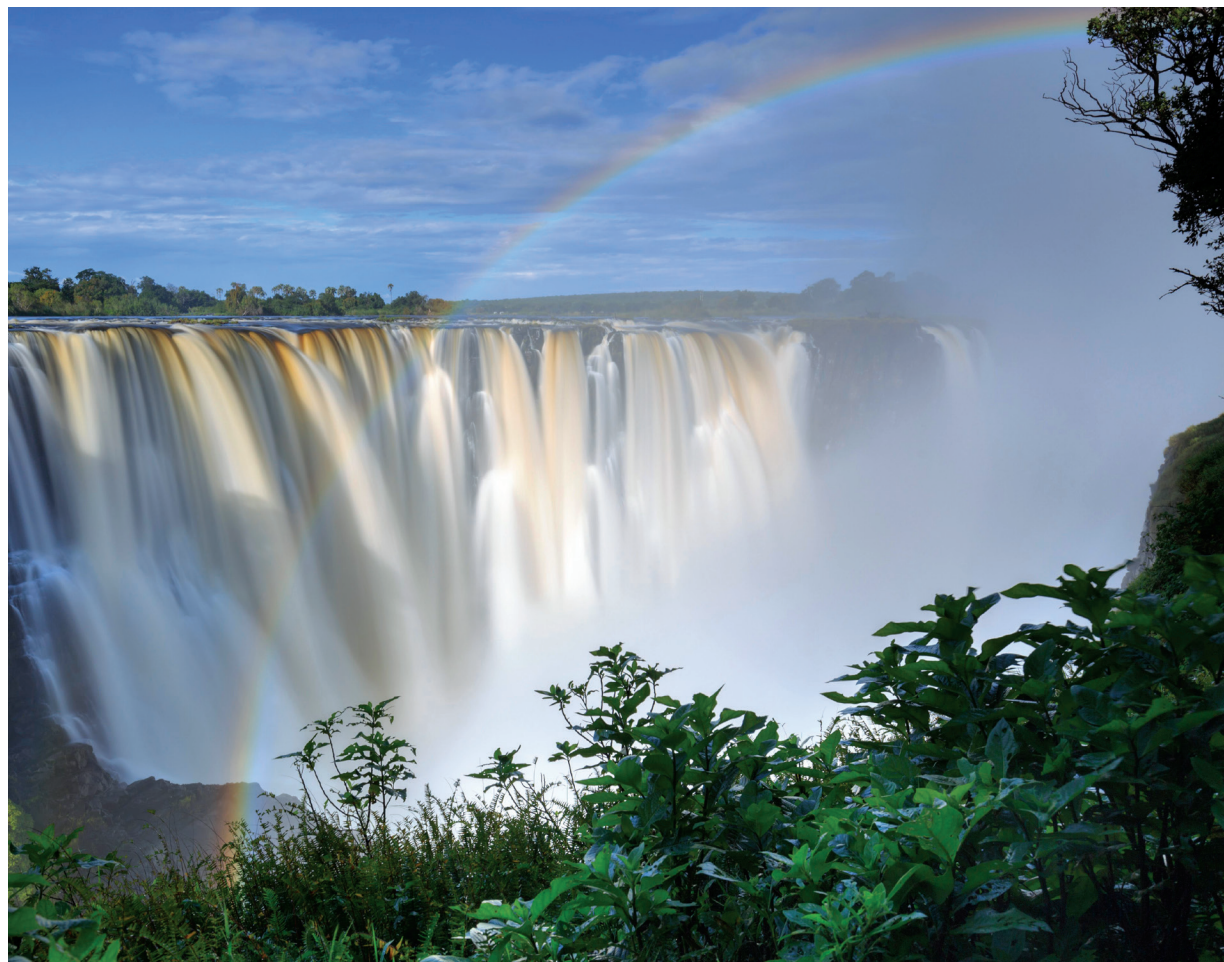
Spanning the width of the Zambezi River, Victoria Falls is the world's largest waterfall.

Day 1: Depart U.S. for Johannesburg, South Africa