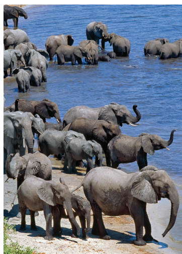
Elephants abound at Chobe.

Day 11: Sossusvlei/Swakopmund We travel today through the Namib desert en route to Swakopmund, Namibia's largest port. B,L,D