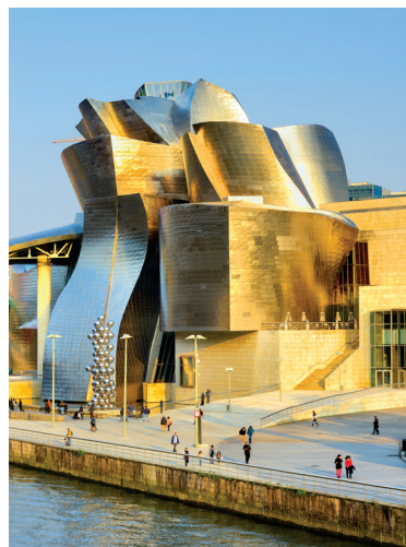
We tour Bilbao's Guggenheim on Day 10.

Day 11: Bilbao/Basque Country A day-long excursion begins with a poignant stop: Gernika (Guernica), heart of the Basque region and the town razed by