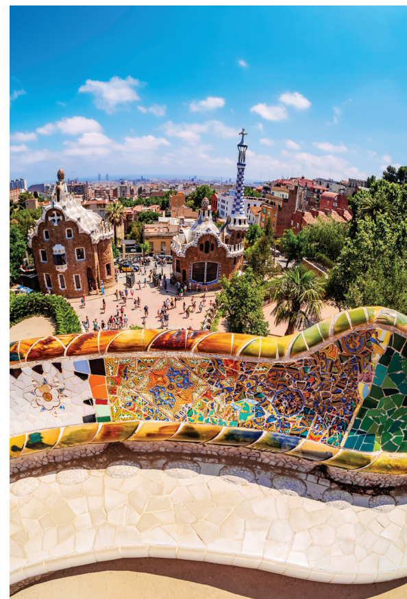
Barcelona's colorful Parc Guell, which we visit on Day 15

Day 17: Depart for U.S. We transfer to the airport this morning for our connecting flights to the U.S. B