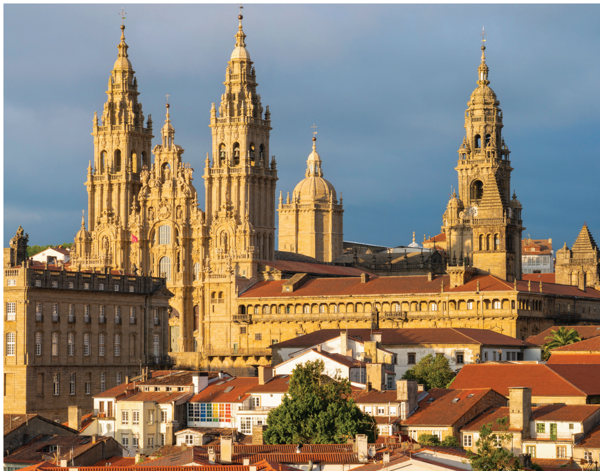
Santiago's 11 th -century cathedral, which we visit on Day 7, is the last stop on the pilgrimage route of the Way of St. James.