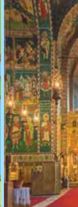
Admire the elaborate interior of Saints Peter and Paul's Church in Bratislava.

Buda Castle Quarter, site of the Roman city of Aquincum; and the illustrious palaces, mansions and squares of elegant Andrásy Avenue.