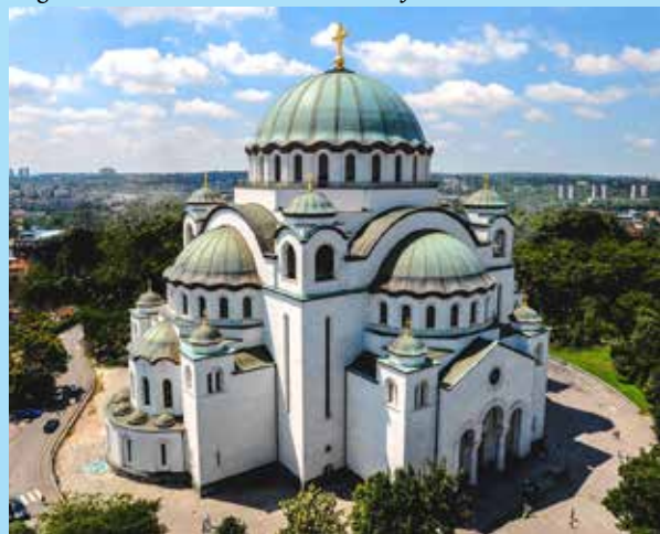
View the Patriarch's Cathedral of the Ascension, crowning the medieval citadel of Veliko Târnovo.