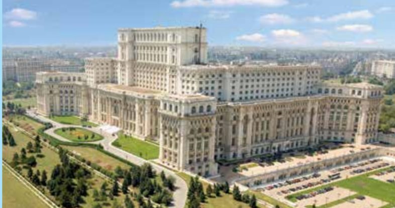
Visit Bucharest's Palace of Parliament, which took seven hundred architects and 20,000 builders over five years to construct, which today houses three museums.

Tour the famous "House of Flowers" memorial dedicated to former Yugoslavia's longstanding leader, Josip Broz Tito.