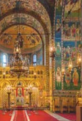
Ornate frescoes of the Cathedral of the Ascension in Veliko Târnovo.