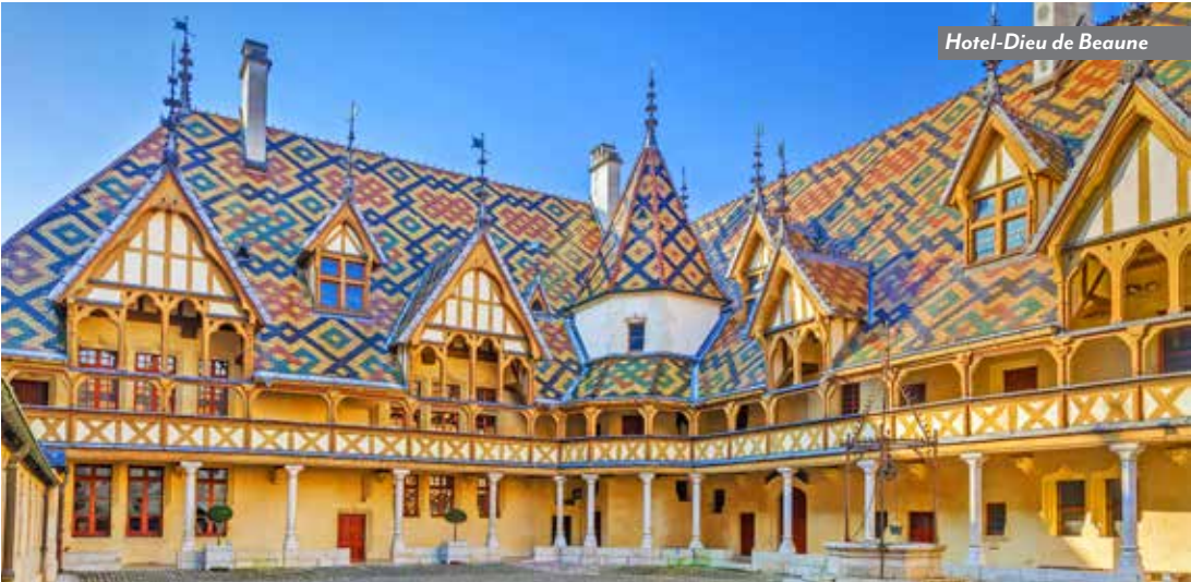
Hotel-Dieu de Beaune