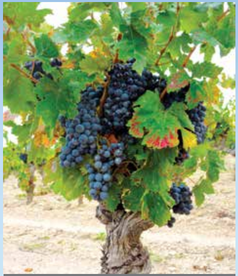
Grapes in a Provence vineyard