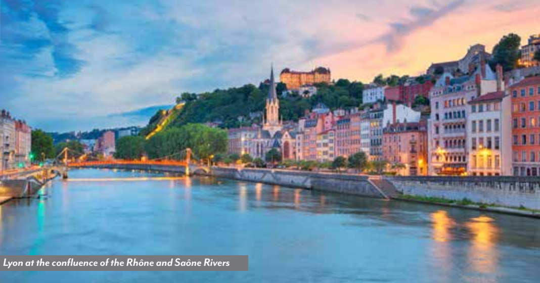
Lyon at the confluence of the Rhône and Saône Rivers