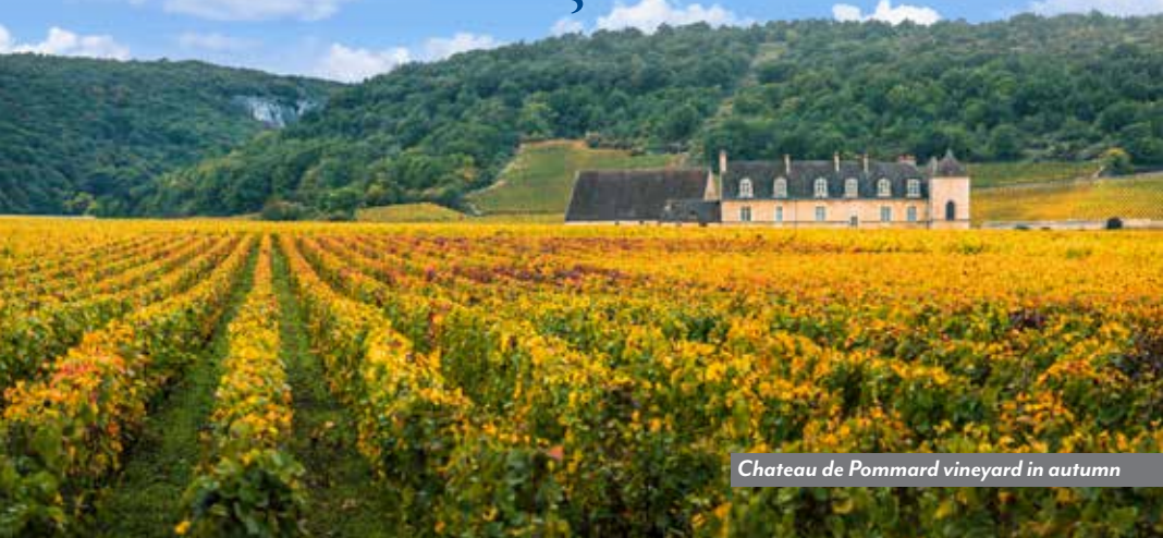
Chateau de Pommard vineyard in autumn

Provence's meticulously pruned vineyards and idyllic hillsides during the autumn harvest season form a mesmerizing backdrop for a living canvas, where a quaint streetside café in Arles once served as Van Gogh's muse, a 16 th -century castle has evolved into a renowned Beaujolais wine estate, and France's oldest Roman theater still stages performances in Lyon's Fourvière district. Experience southeast France's breathtaking landscapes, which remain forever entwined with the nation's achievements in fine art, cuisine, architecture, and literature.