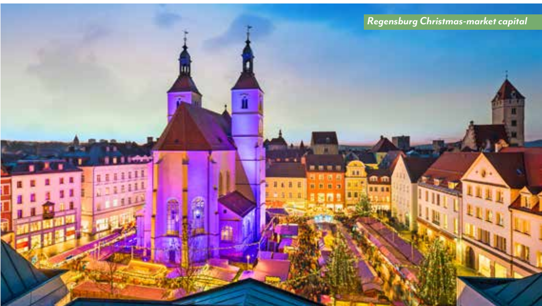
Regensburg Christmas-market capital

Disembark ship and transfer to Nuremberg Airport for your return flight home.