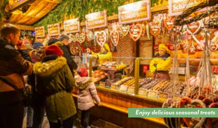
Enjoy delicious seasonal treats