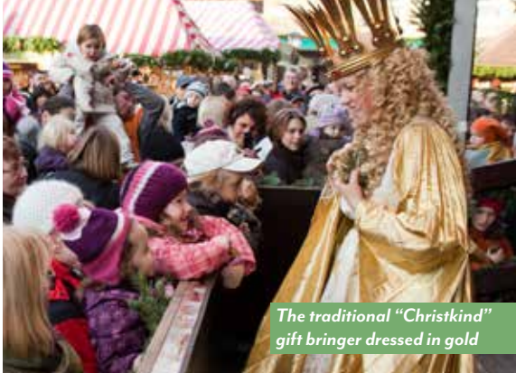
The traditional "Christkind" gift bringer dressed in gold