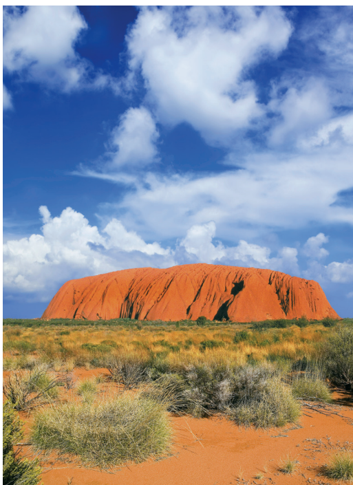
We visit the Aboriginal site of Uluru (Ayers Rock) on Day 8.