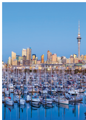
Auckland, City of Sails

Day 19: Rotorua This morning we visit Rainbow Springs Nature Park, a showcase of native flora, fauna, and birdlife, and where we tour the National Kiwi Trust, which rehabilitates injured kiwis, the national bird. B