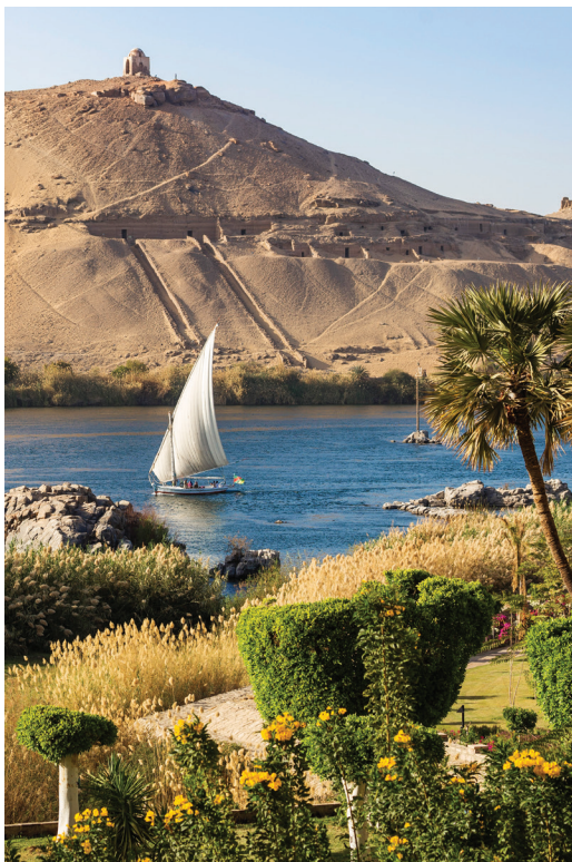
We sail traditional feluccas along the Nile.

Day 15: Depart for U.S. Very early this morning we transfer to the airport for our return flight to the U.S. B