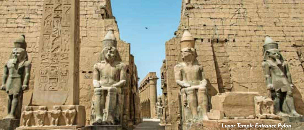
Luxor Temple Entrance Pylon