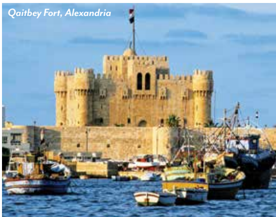
Qaitbey Fort, Alexandria

Disembark the ship and join the Ancient Greece Post-Program Option, or transfer to the airport for your flight home. (B)