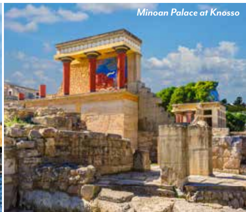
Minoan Palace at Knossos