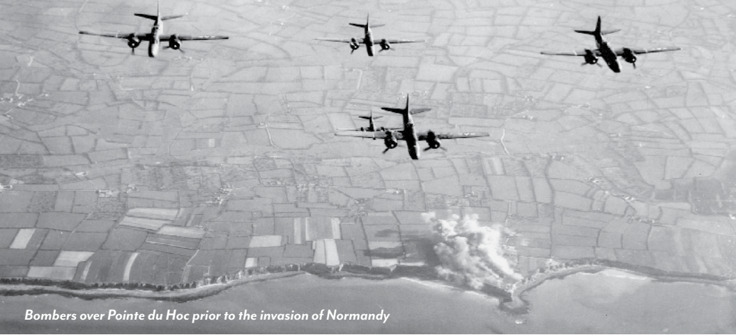
Bombers over Pointe du Hoc prior to the invasion of Normandy