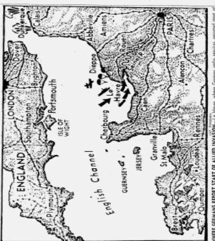
WHERE GERMAN REPORT START OF ALLIED INVASION—Paris, where the capture from Bayeux, England, by the British army, June 6, 1944. (AP) (Inset shows the capture from Bayeux, England, by the British army, June 6, 1944.)

LONDON, June 6 (AP)—The German news agency today said that the German army had been reinforced by 200,000 men and that the German army was prepared to fight a fierce battle at Caen.