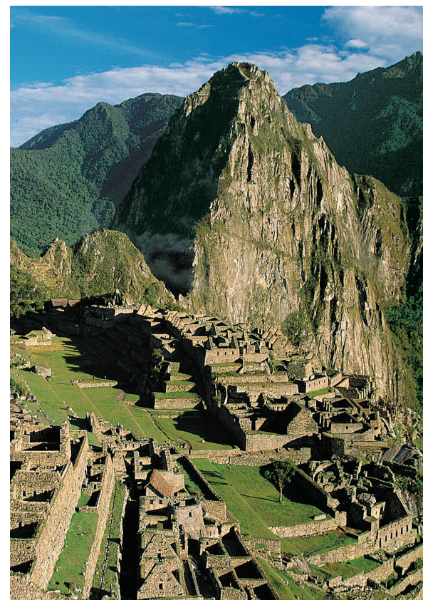
We explore the amazing ruins at Machu Picchu on Days 5 & 6.