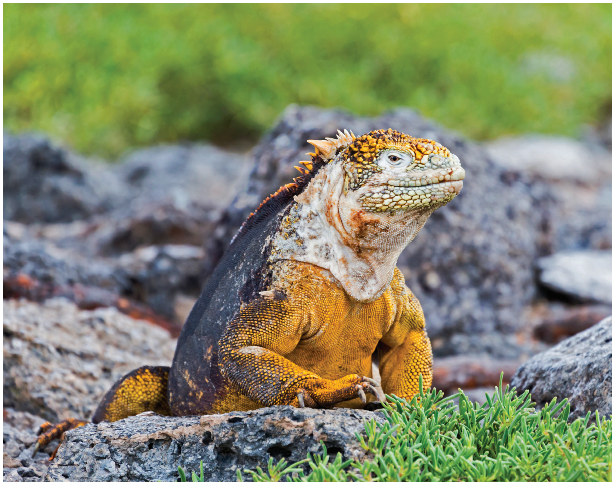
We'll encounter plenty of wildlife in the Galapagos, including relatives of this land iguana.