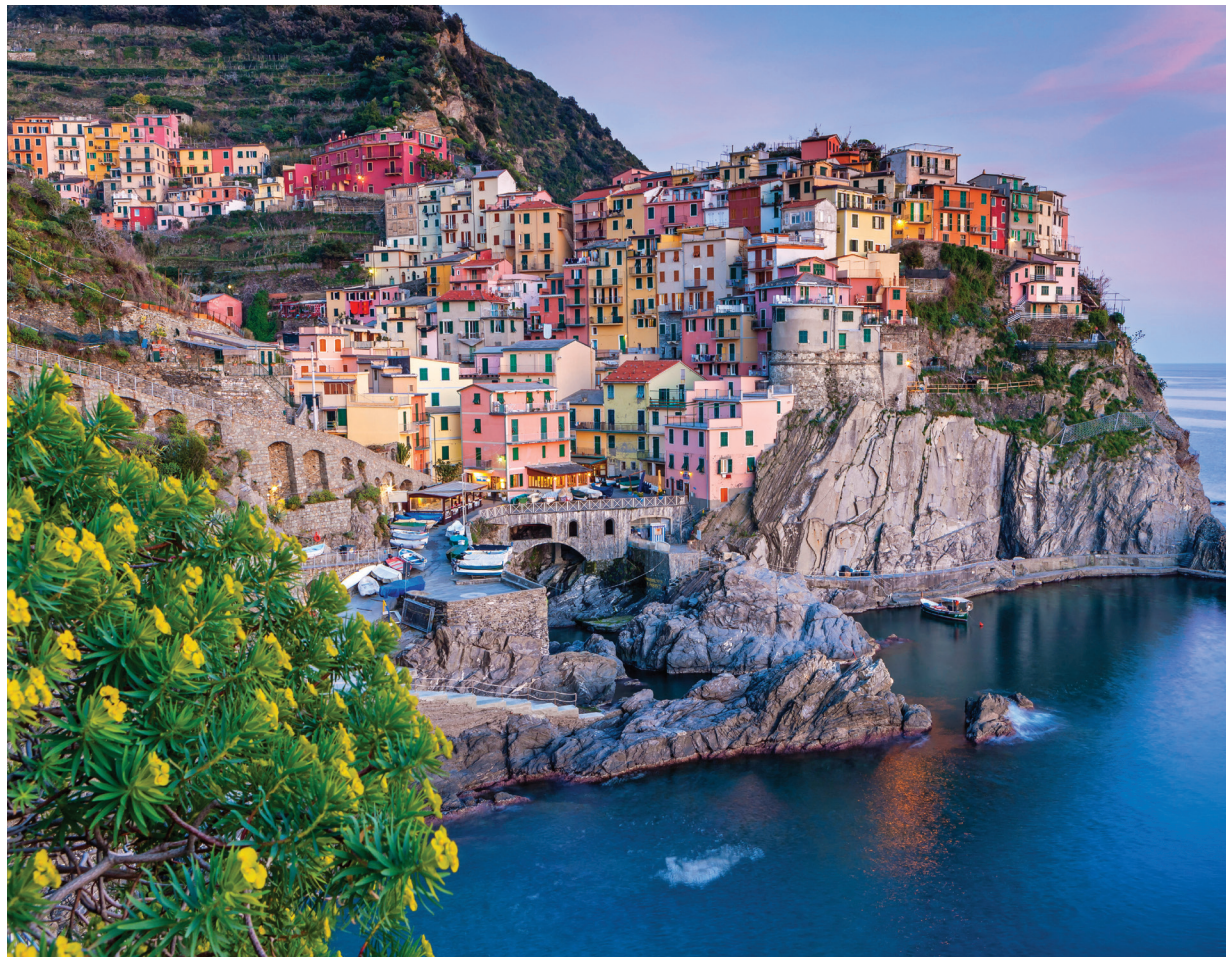
We see Liguria's Cinque Terre, a UNESCO site, by land and sea on Day 7.