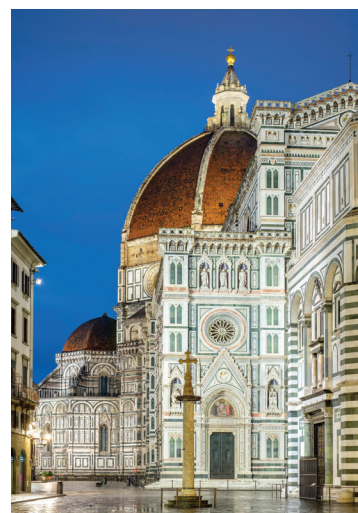
Florence's Duomo and Baptistry

Today we visit the walled city of Siena, whose historic center is a UNESCO site and whose ochre-colored buildings and ancient ramparts vividly evoke its medieval