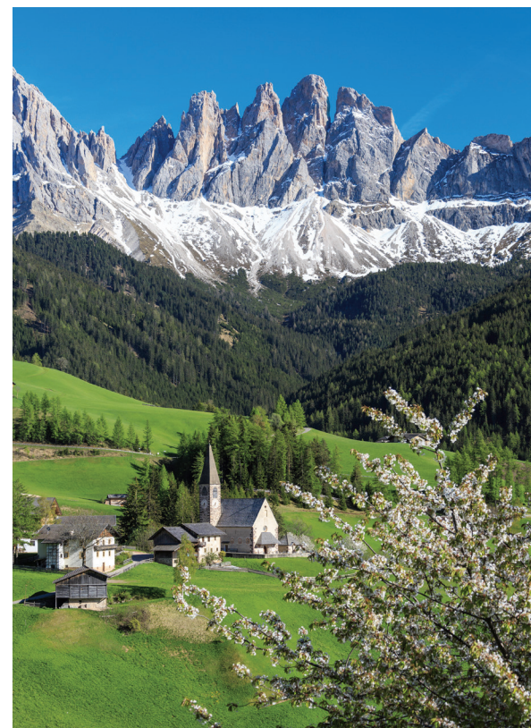
We enjoy stunning Dolomites scenery in the South Tyrol.

Day 15: Depart for U.S. We depart early this morning for our connecting flights to the U.S. B