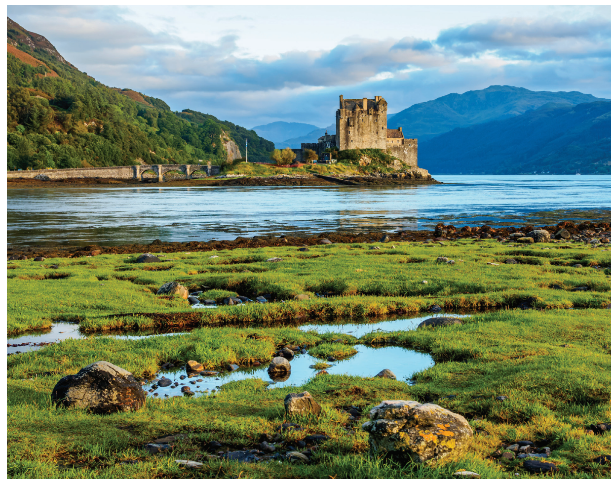
Eilean Donan Castle, which we visit on Day 5, stands as one of Scotland's most beautiful fortresses.

Ratings are based on the Hotel & Travel Index, the travel industry standard reference. Unrated hotels may be too small, too new, or too remote to be listed.