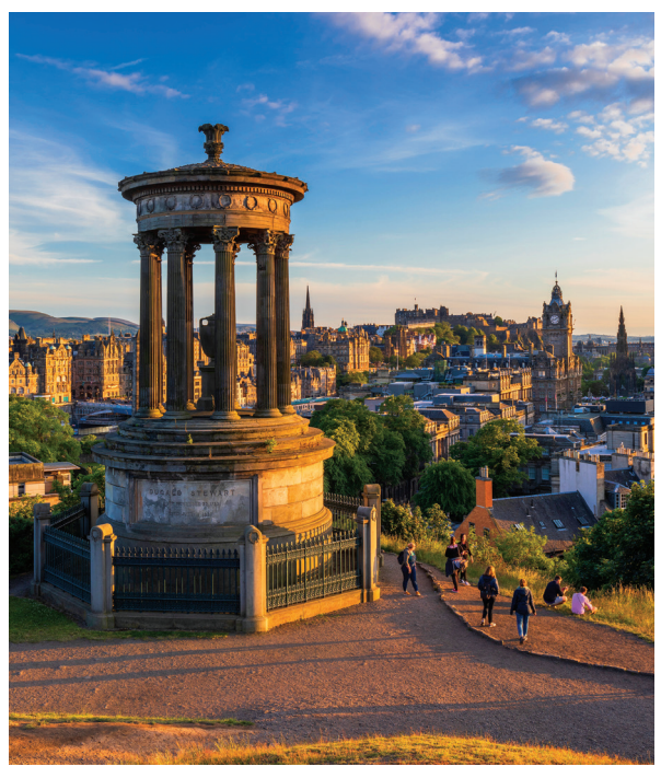
Edinburgh skyline, from Calton Hill

restaurants. We tour Holyrood, as it is called, and see where British royalty schemed and slept as we tour the State Apartments. The remainder of the day is free for independent exploration. Tonight we celebrate our Scotland sojourn over a farewell dinner at a local restaurant. B,D