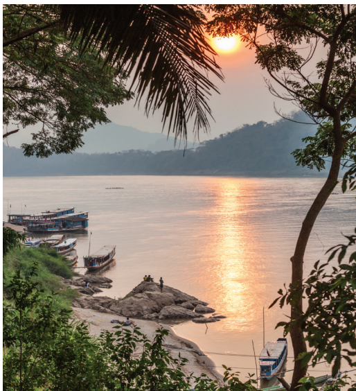
We spend two days cruising the Mekong.

Day 18: Bangkok This morning’s visit to the Jim Thompson House reveals the prized Southeast Asian art collection of the American who revived the Thai