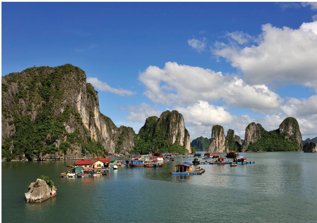
We visit the World Heritage site of Ha Long Bay on Day 4.

and Bayon Temple, an imposing stone edifice of 54 towers each carved with four enigmatic faces. We also explore 12 th -century Ta Prohm, the mystical, decaying Buddhist shrine where the giant roots and limbs of banyan trees have overtaken the labyrinth of stone rooms and hallways. Later we tour stunning 12 th -century Angkor Wat itself, the world's largest temple. B,L,D