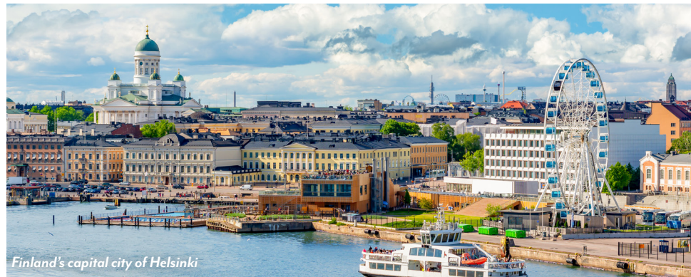
Finland's capital city of Helsinki