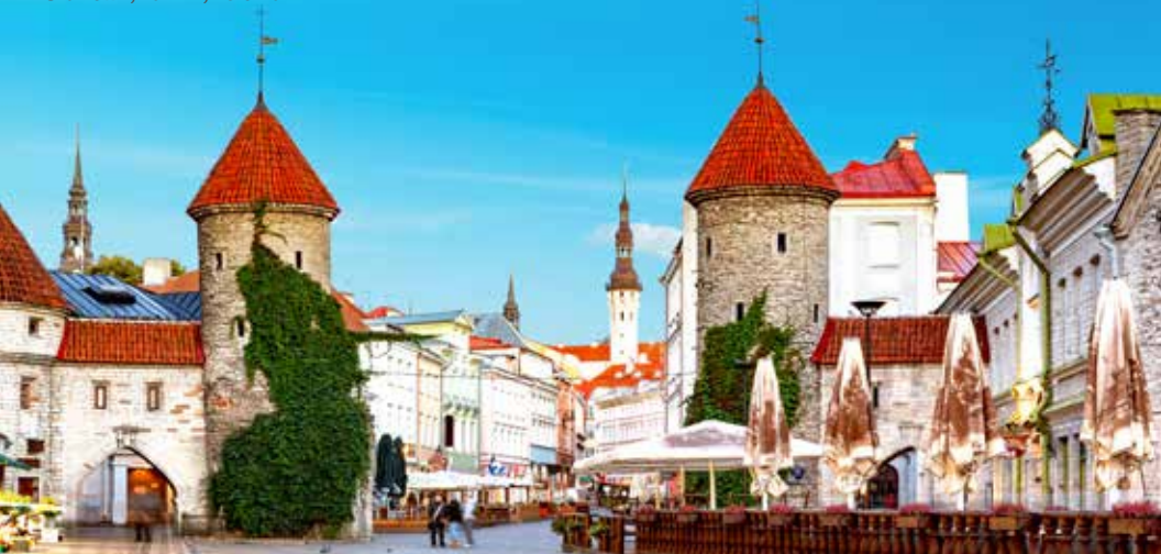
Old Town, Tallinn, Estonia

In his oft-quoted poem, "The Road Not Taken," Robert Frost awakened the idea and determination in many to choose the road less traveled; to overcome fear and avoid regrets. It sparked the quest for adventure in those wishing to experience more from life. Intrepid world travelers manifest this idea by seeking out destinations less traveled, such as Scandinavia and the Baltic Sea, which is surrounded by nine countries in Northern Europe. Here, travelers have the rare opportunity to visit a number of countries and experience a kaleidoscope of cultures in a short period of time when cruising by ship from port to port. Ancient architecture, centuries-old history, storied landmarks, fascinating cities, and breathtaking, romantic scenery provide the perfect backdrop and opportunity to take the road less traveled, which will surely make all the difference.