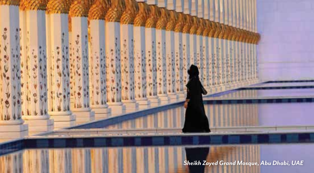
Sheikh Zayed Grand Mosque, Abu Dhabi, UAE