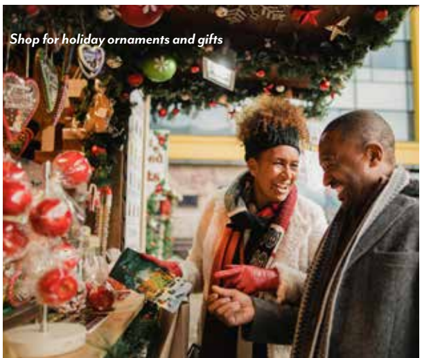
Shop for holiday ornaments and gifts