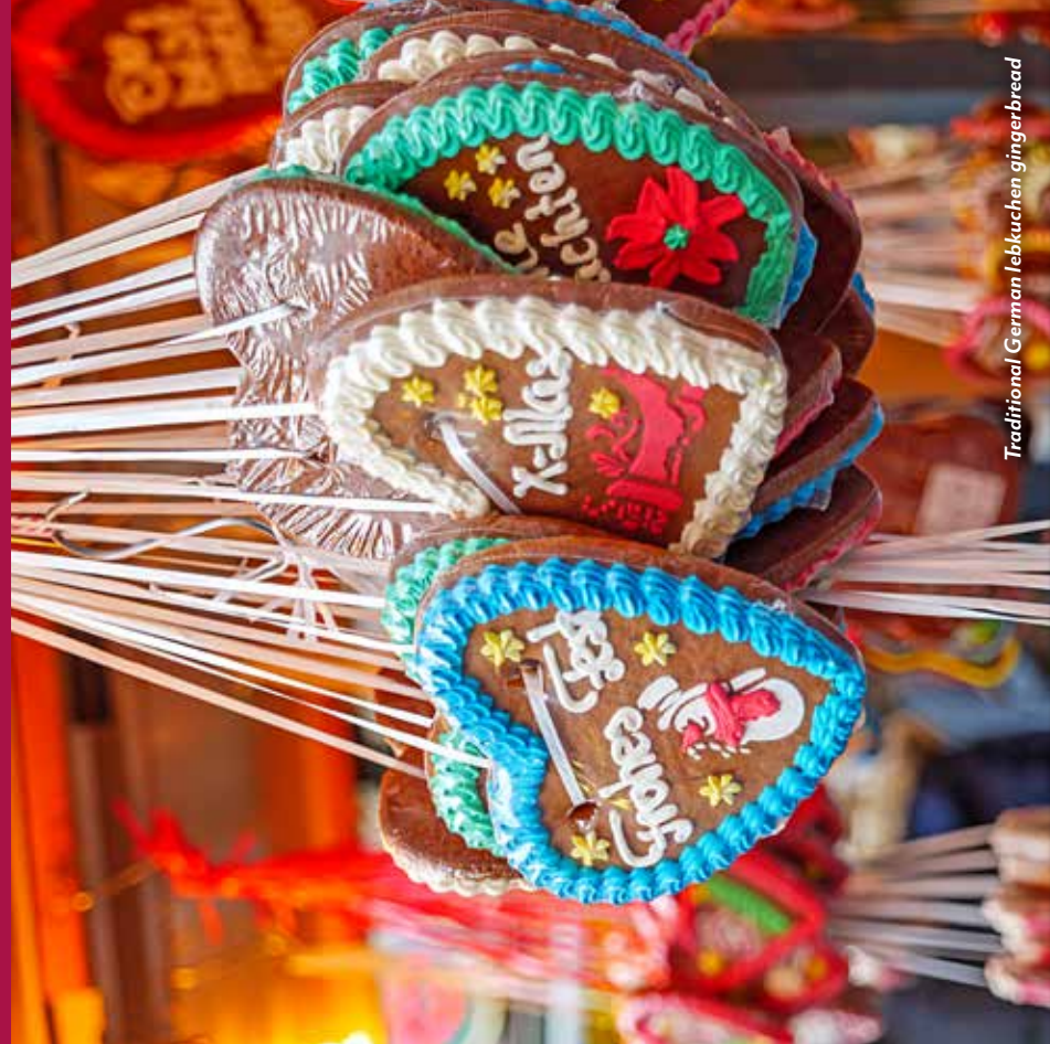
Traditional German Lebkuchen gingerbread

VMFA 200 N Arthur Ashe Boulevard Richmond, VA 23220-4007 032-346