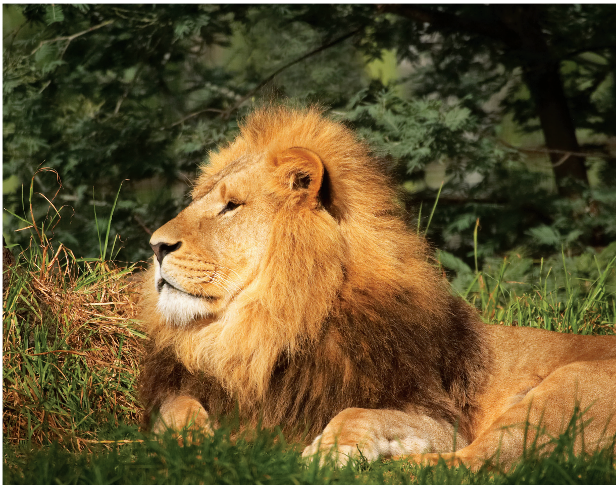
Leader of the pride: a male lion rests before his next hunt.