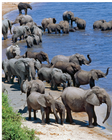
Elephants abound at Chobe.

Day 10: Chobe National Park/South Luangwa National Park, Zambia This morning we board