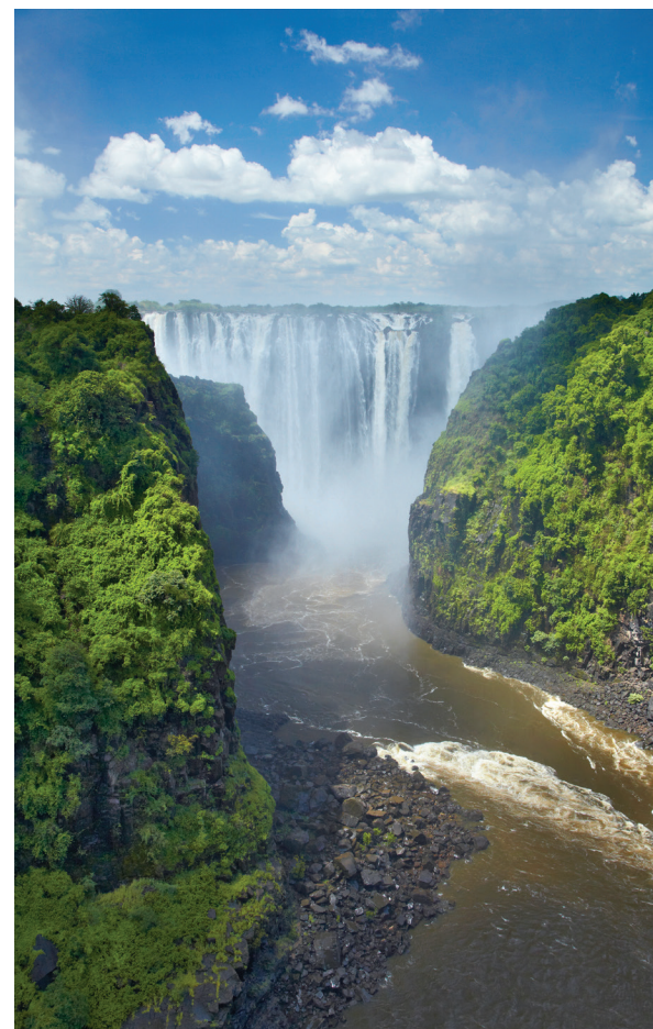
Victoria Falls, the “smoke that thunders”

Day 14: Arrive U.S. We arrive in the U.S. this morning and connect with our flights home.