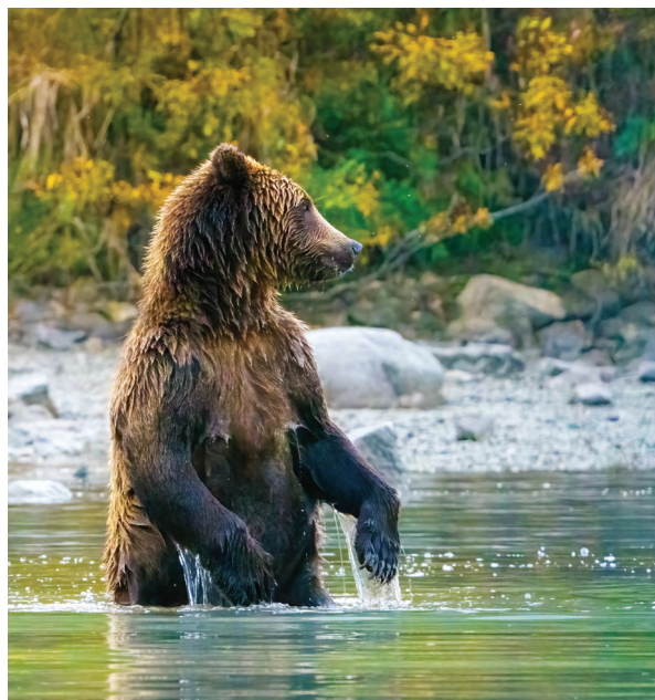
Taking a stand ...

Day 6: Wrangell-St. Elias National Park Home to more than 150 glaciers, Wrangell-St. Elias National Park contains the largest collection of these ice masses in North America. We see one of these glaciers up close today on our singular half-day hike to Root Glacier. After being fitted with crampons – steel shoe spikes created to traverse ice – we begin our three-mile excursion to the glacier and behold the natural beauty before us: unspoiled icefields, blue pools, cascading waterfalls, deep canyons, narrow crevasses. We eat a sack lunch in the wild then return to our lodge for an afternoon at leisure. Tonight, we enjoy dinner together at our lodge. B,L,D