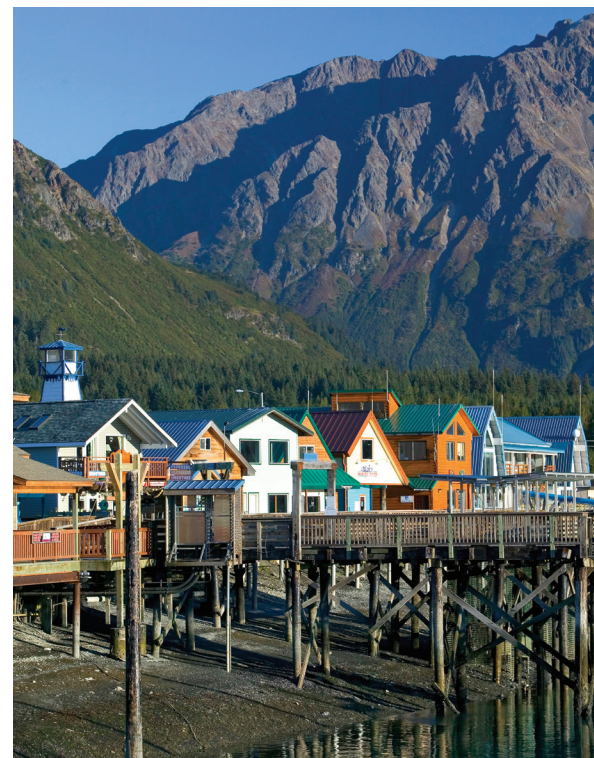
Colorful buildings overlook Seward's harbor.

11 of Alaska's major Indigenous cultural groups and where we enjoy a tour of the center and watch a dynamic Native Games demonstration. Tonight, we celebrate our journey through Alaska at a farewell dinner. B,D