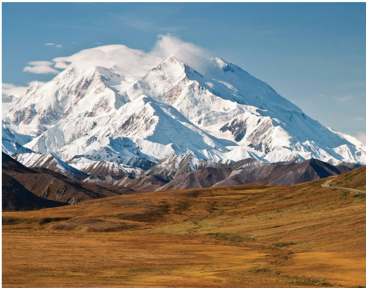
A highlight of any journey to Alaska: Denali, North America's highest peak

Ratings are based on the Hotel & Travel Index, the travel industry standard reference.