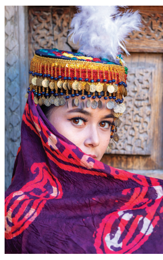
Uzbek performer in costume

Day 10: Khiva We continue our exploration of this 1,500-year-old city at the turquoise-tiled Kalta Minor minaret – enormous, stout, and unfinished. We continue on to Kunya Ark citadel; the immense Madrassah of Muhammad Rahim Khan, with its tiled façade; the 163-room Tash Hauli Palace; and the Hunarmand artisans' workshop. Tonight, we dine on a rooftop terrace overlooking the city, where we enjoy a sunset cocktail party followed by dinner with a local folklore performance. B,D