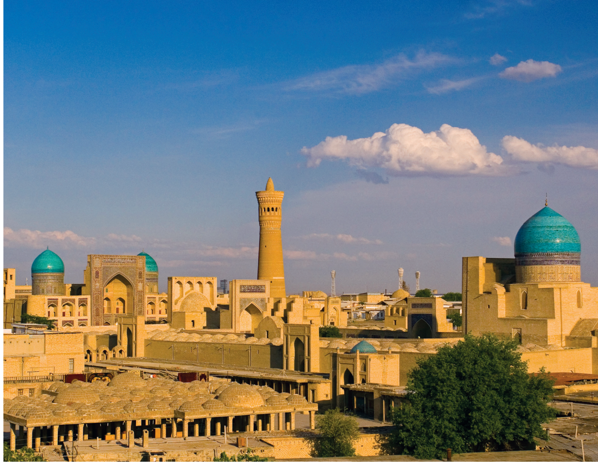
Ancient Bukhara, whose historic center (above) is a UNESCO World Heritage site.