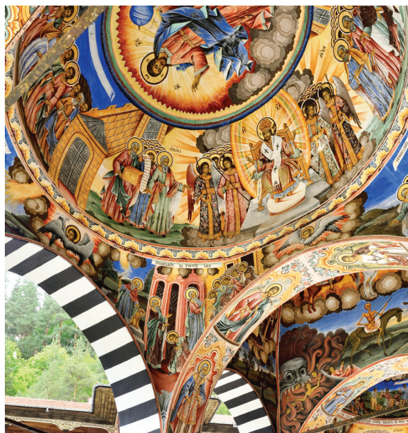
Frescoes at Rila Monastery

Day 17: Depart for U.S. We transfer to the Bucharest airport for our return flights to the U.S. B