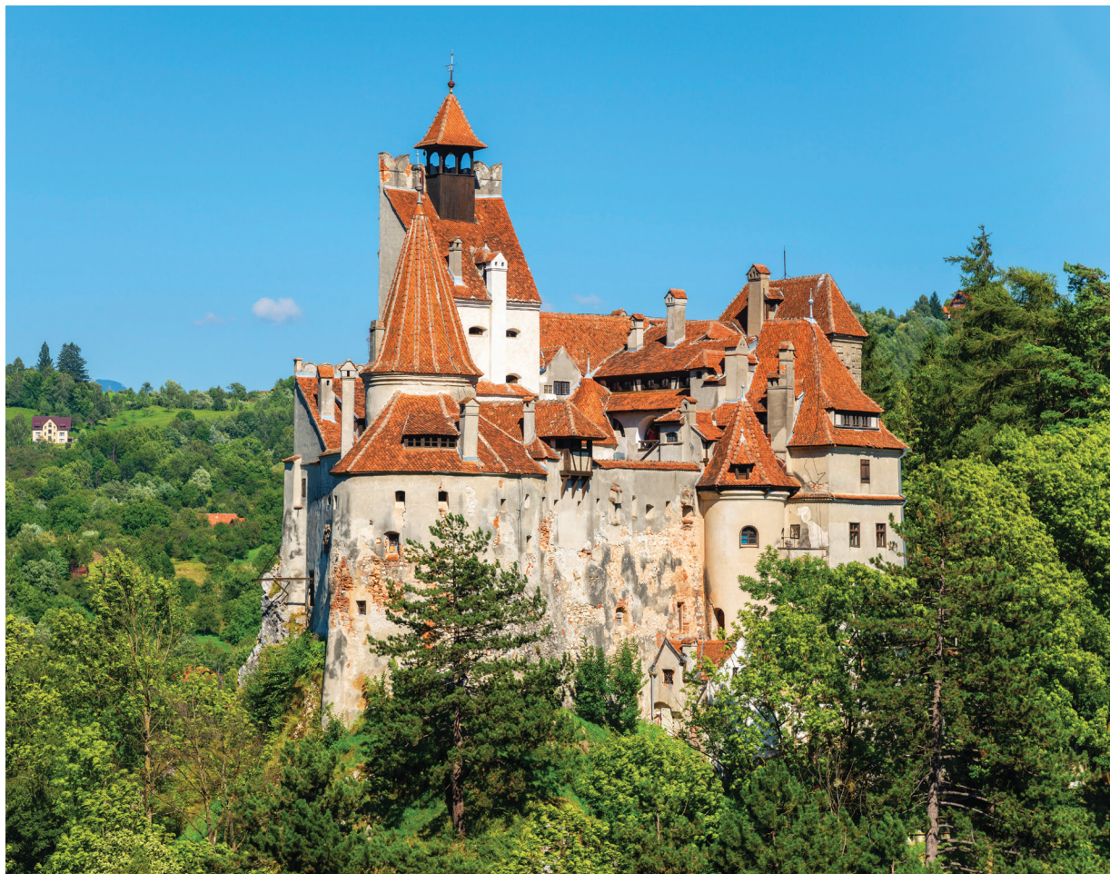
On Day 15, we tour 14 th -century Bran Castle, believed to be the inspiration for the home of Bram Stoker's Count Dracula.

Ratings are based on the Hotel & Travel Index, the travel industry standard reference.