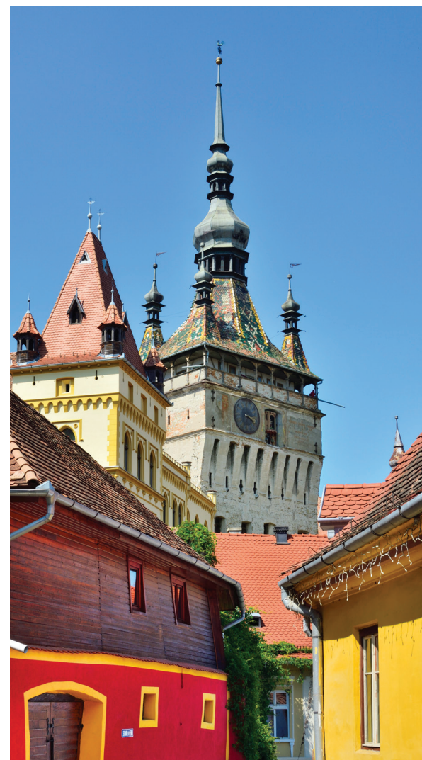
Sighisoara's medieval Old Town and clock tower