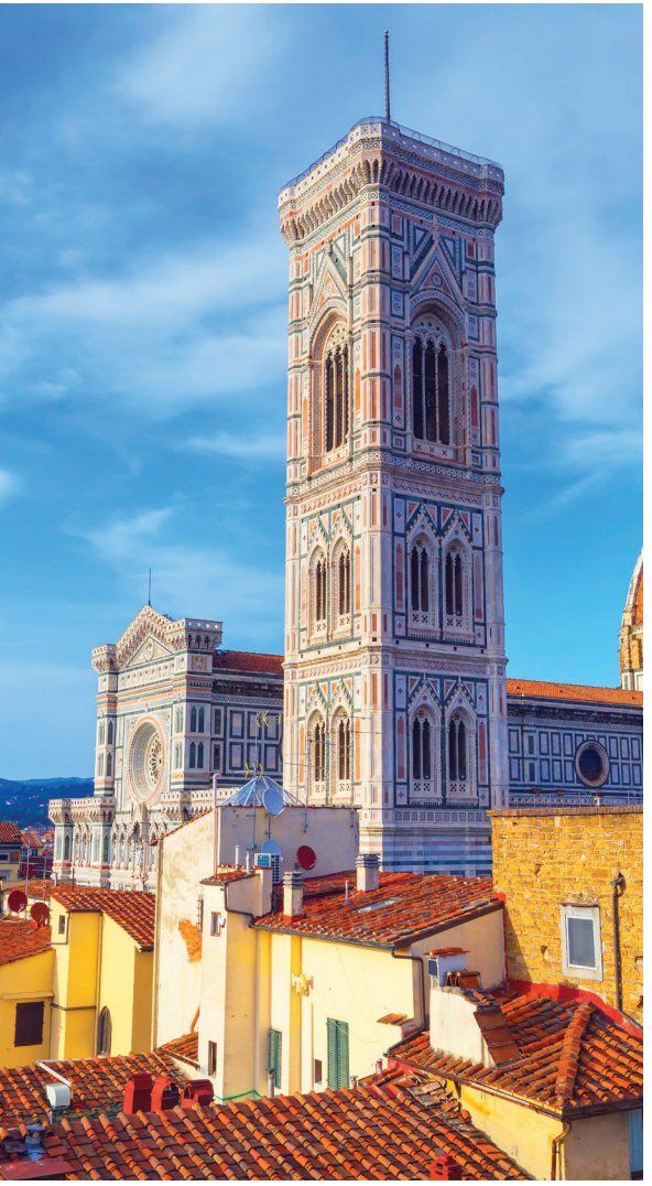
Giotto's Belll Tower rises above the rooftops of Florence.