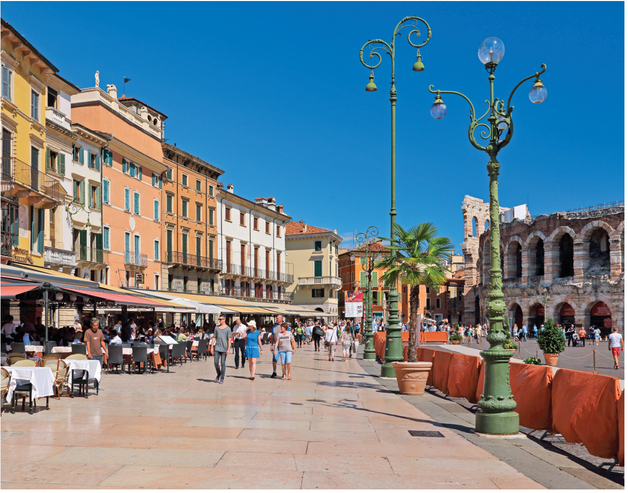
Historic buildings, lively cafés, and the 1<sup>st</sup> century Roman amphitheatre flank Verona's grand Piazza Bra.