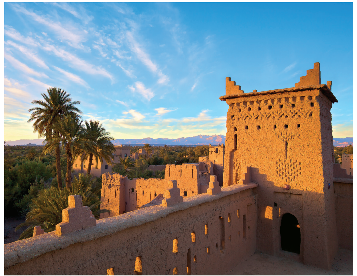
We travel the "Route of a Thousand Kasbahs" ancient caravan trail during our journey.

Ratings are based on the Hotel & Travel Index, the travel industry standard reference.