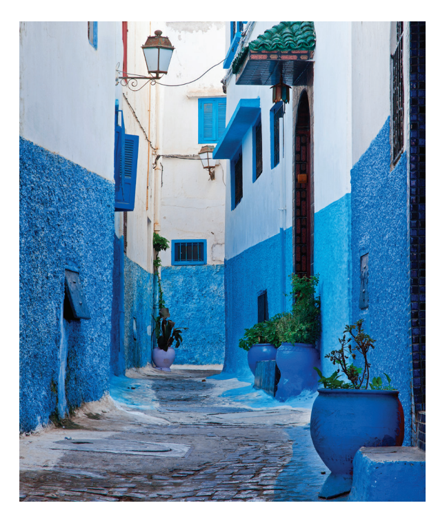
Rabat's Kasbah des Oudaias

Day 10: Ouarzazate/Ait ben-Haddou/Marrakech En route to Marrakech today, we stop first at uninhabited Ait ben-Haddou, a UNESCO World Heritage site and one of southern Morocco's most scenic villages that is often used as a location for fashion and film