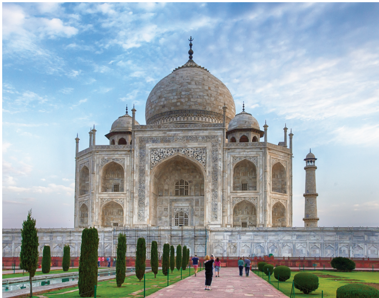
On Day 12 we visit the Taj Mahal, a UNESCO site considered one of the world's most beautiful buildings.