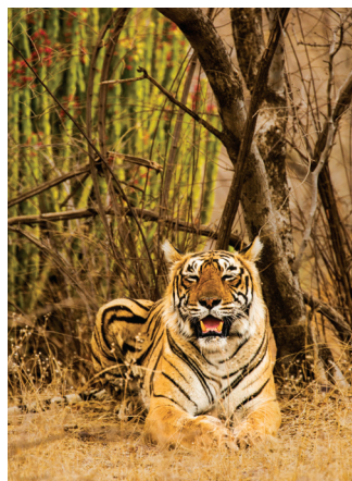
Bengal tiger rests in Ranthambore.

Day 11: Gadoli/Agra En route to Agra, we stop in the ancient village of Abhaneri to see the fortified Chand Baori step well (c. 800 CE), whose 3,500 steps descend some 13 stories into the ground. Continuing on, we reach the ancient Mughal stronghold of Agra,