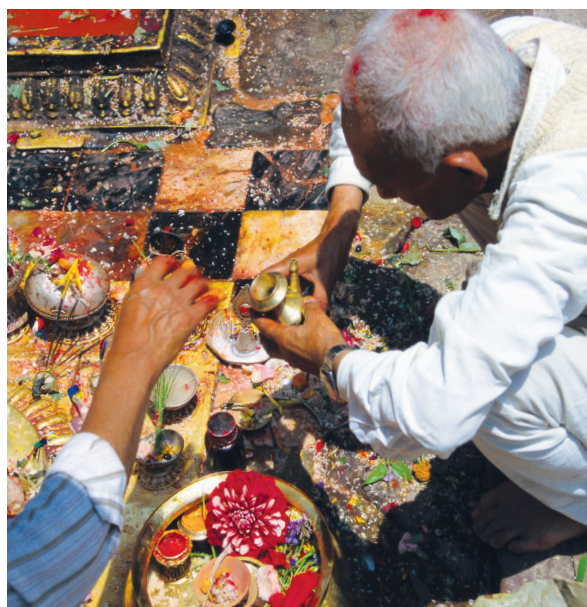
Typical marketplace scene

Day 15: Varanasi Early this morning we return to the Ganges where Hindu pilgrims perform their rituals along the ghats (steps) leading to the river. We visit several ghats by boat as we experience for ourselves the spiritual aura of the hallowed Ganges waters. Then we return to our hotel with time to rest before this afternoon’s walking tour and private performance of classical sitar. Tonight we celebrate our journey at a farewell dinner at our hotel. B,D