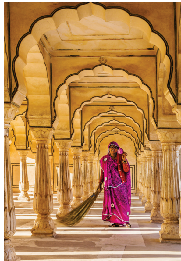
We explore Jaipur’s Amber Fort on Day 6.

Day 16: Varanasi/Delhi We fly this afternoon to Delhi, where the evening is at leisure. B