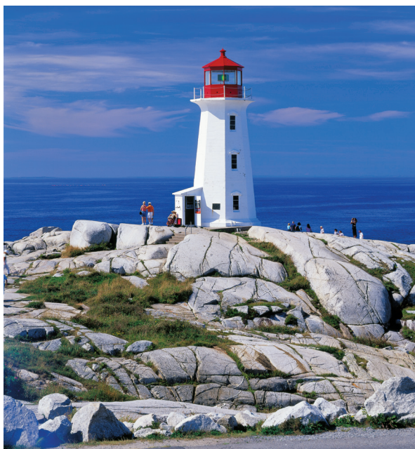
Iconic lighthouse at Peggy’s Cove

Day 6: Shediac/Charlottetown, Prince Edward Island This morning we cross the 8-mile-long Confederation Bridge connecting mainland Canada to Prince Edward Island (PEI). Many PEI residents trace their lineage back to the area’s first French and English settlers, and we learn about this rich historical tradition at our first stop on the island: Village Musical Acadien, which hosts cultural events, concerts, and community theater. We continue on to Charlottetown, PEI’s capital and our home for the next two nights. Known as the “Birthplace of Confederation,” Charlottetown hosted the Charlottetown Conference of 1864, which paved the way for