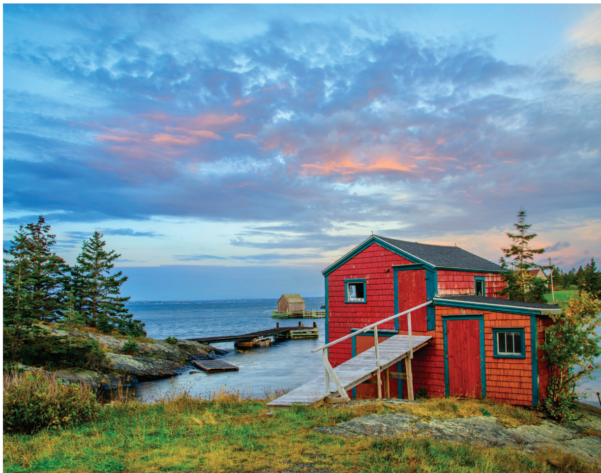
Typical rural scene in the Maritime province of Nova Scotia

Day 1: Arrive Halifax, Nova Scotia We arrive today in Halifax, capital of the Canadian province of Nova Scotia and a bustling center of commerce and shipping. As guests' arrival times may vary greatly, we have no group activities or meals planned for today.