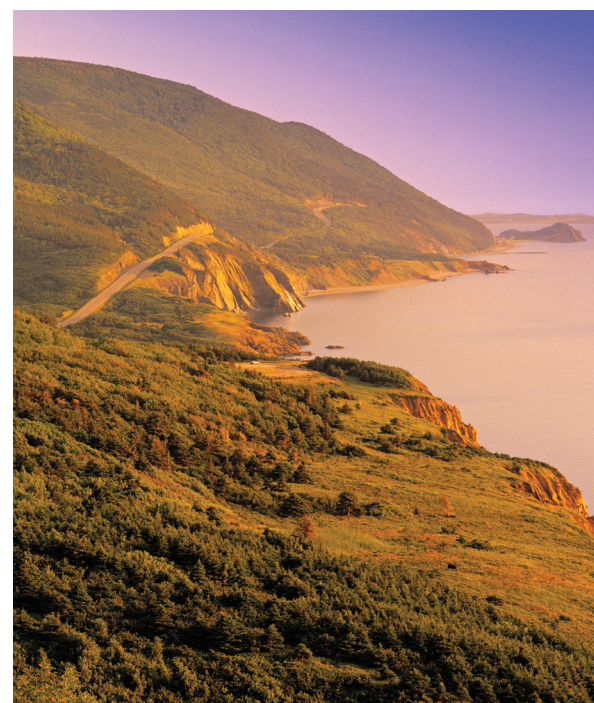
On Day 9, we travel the dramatic Cabot Trail.

town, where we have free time to explore as we wish followed by dinner at a local restaurant. B,D