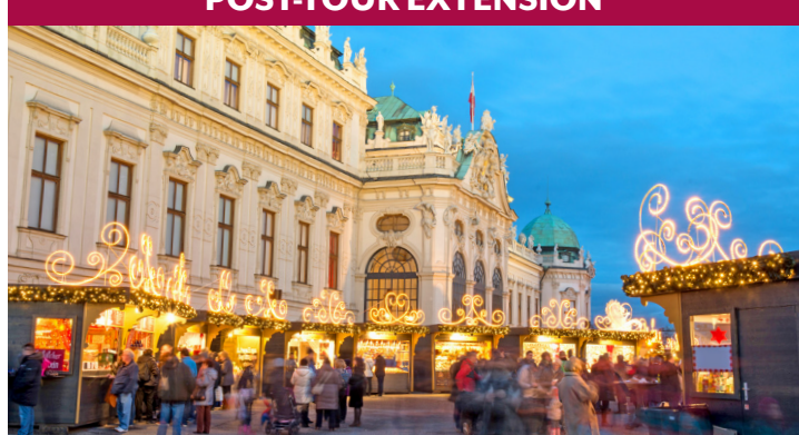
Vienna | 3 days, 2 nights December 16 to 18, 2025 | Program Ends: December 18

All Program Features are contingent upon final brochure pricing. 2025