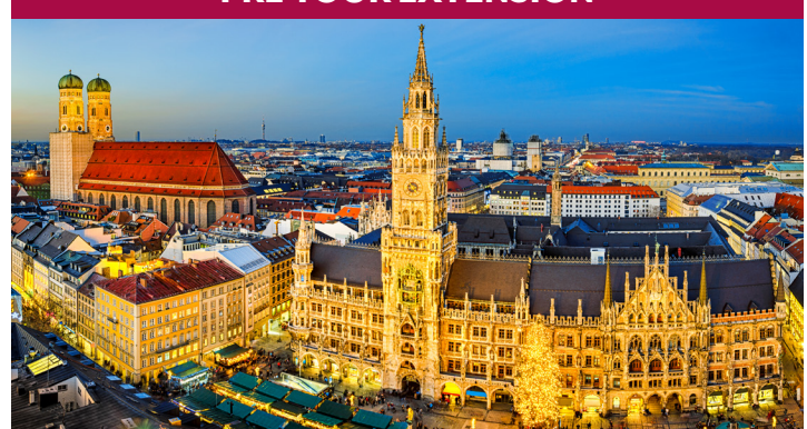
Munich | 4 days, 3 nights December 6 to 9, 2025 | Program Begins: December 7