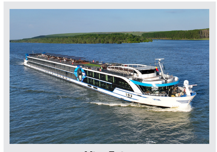
Viva Enjoy Exclusively Chartered, Deluxe River Boat