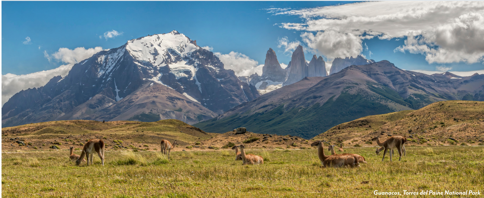
Guanacos, Torres del Paine National Park