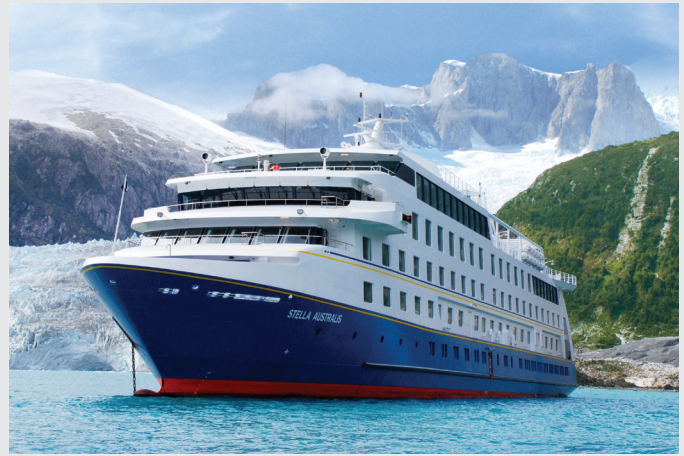
Stella Australis Exclusively Chartered, First-Class Small Ship