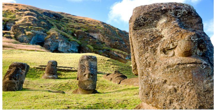
Easter Island | 5 days, 4 nights October 18 to 23, 2025 | Program Begins: October 19