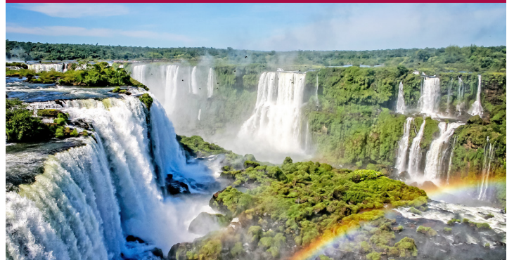
Buenos Aires & Iguazú Falls | 5 days, 4 nights November 1 to 6, 2025 | Program Ends: November 6

All Program Features are contingent upon final brochure pricing. 2025