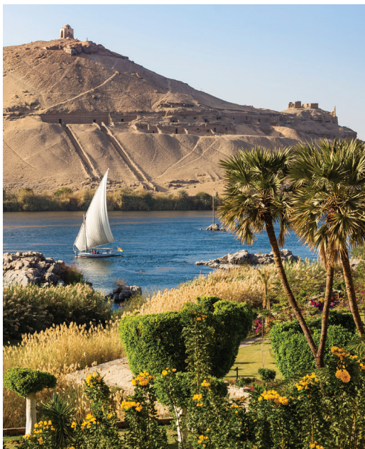
We sail traditional feluccas along the Nile.

Day 14: Cairo This morning we encounter Old Cairo, the district where early capital cities once stood and now only remnants remain. We visit 5 th -century St. Sergius Church, the Coptic church of el-Muallaqa, and the active 10 th -century St. George’s church. Mid-day we return to our hotel where tonight we enjoy a farewell dinner. B,D