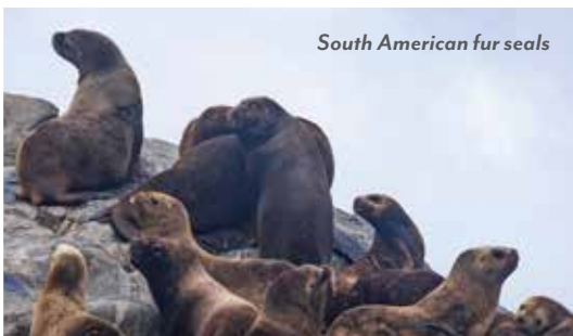
South American fur seals