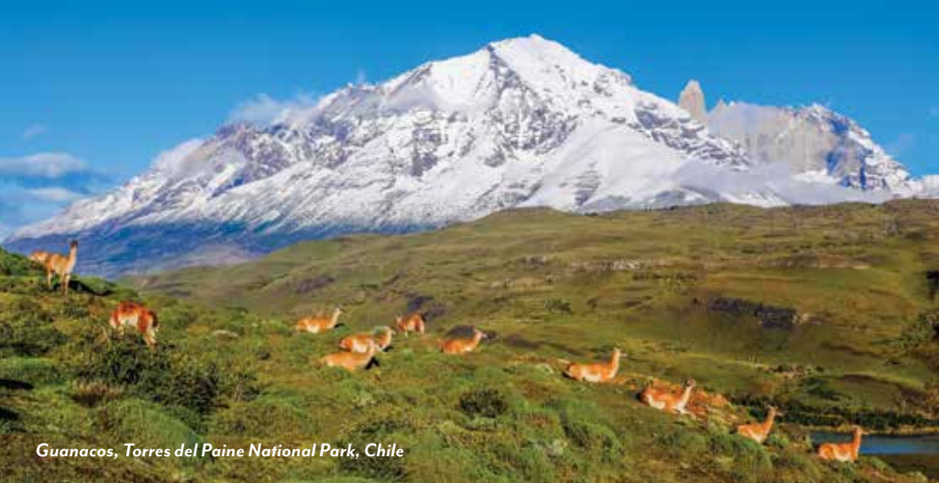
Guanacos, Torres del Paine National Park, Chile