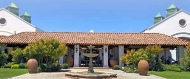
Casas del Bosque Winery, Chile

With Chile's variety of pleasing wines, from classic terroir-driven wines to obscure Marselan grapes and delectable dessert wines, wine debutants and oenophiles alike can sip, savor and return home with excellent memories.