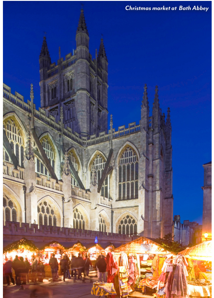
Christmas market at Bath Abbey

All Program Features are contingent upon final brochure pricing. 2026