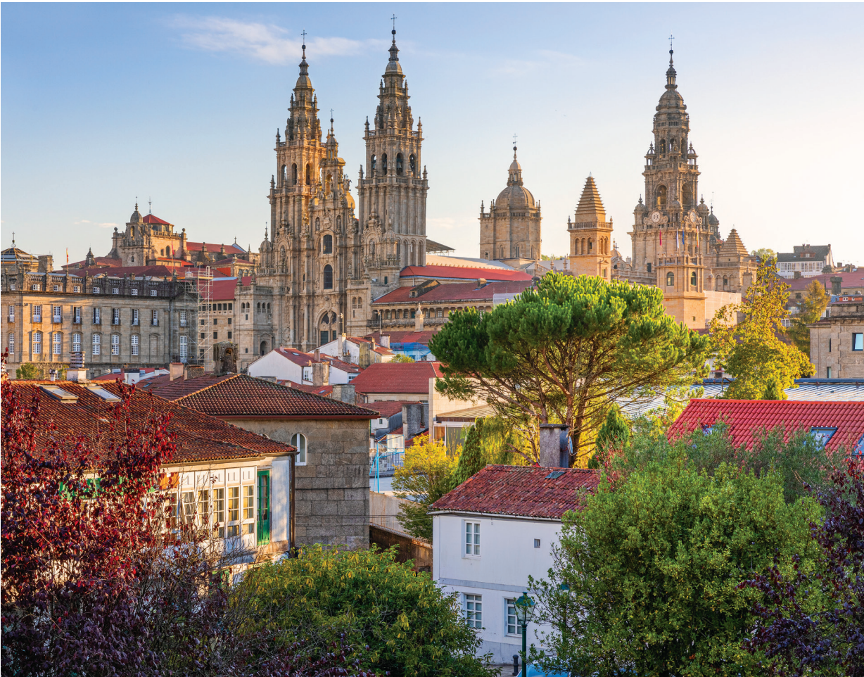
Santiago's 11 th -century cathedral, which we visit on Day 7, is the last stop on the pilgrimage route of the Way of St. James.

Day 2: Arrive Lisbon We arrive in the Portuguese capital and transfer to our hotel. As guests' arrival times vary, we have no group activities planned during the day. Tonight we enjoy a welcome dinner. D