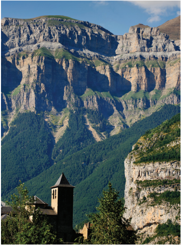
We spend two nights in the Pyrenees.

Day 11: Bilbao/Basque Country A day-long excursion begins with a poignant stop: Gernika (Guernica), heart of the Basque region and the town razed by Nazi bombing in 1937 during the Spanish Civil