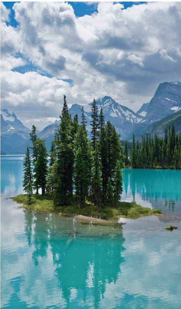
Spirit Island sits in stunning Maligne Lake.

Prices include international airfare and all taxes, surcharges, and fees