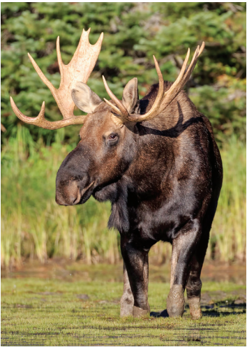
Moose abound in the Rockies.

Day 7: Lake Louise/Jasper This morning we visit the viewing area to see the lake in the early morning light. Then we depart via the Columbia Icefield Parkway for the drive to the