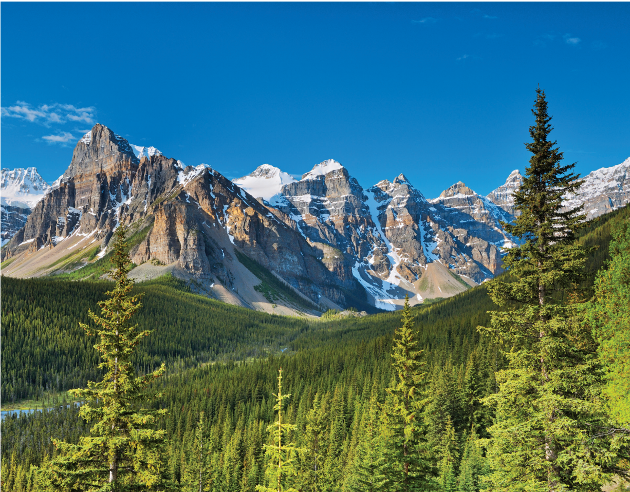
We spend several days absorbing the natural beauty of the Canadian Rockies’ jagged peaks, pristine rivers, and primeval forests.

Day 1: Depart the U.S. for Calgary, Canada We depart the United States today for our flight to Calgary. Upon arrival, we check in to our centrally located hotel then have time to explore this cosmopolitan Canadian city on our own. Tonight we gather for a briefing on the journey ahead followed by dinner at our hotel. D