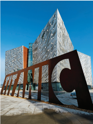
Titanic Museum, optional extension

Day 8: Killarney Our exploration of this attractive town, founded as a resort in the 18 th century, begins with a jaunting cart ride from the center of town to 15 th -century Ross Castle, the last stronghold to fall to Oliver Cromwell’s forces in 1652. Then we travel by boat to Muckcross House, a 19 th -century Elizabethan-style manor which showcases the art and craft of bookbinding, pottery, and weaving. We tour the elegantly furnished rooms, as well as the informal garden. Lunch is on our own here before