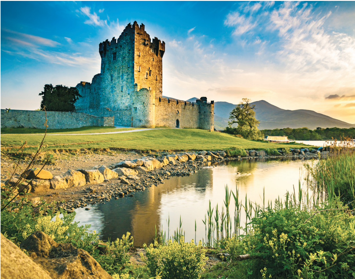
We ride by traditional jaunting carts to Ross Castle on Day 8.