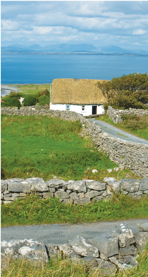
We spend Day 6 on the Aran Islands' Inishmore.

Day 13: Depart for U.S. We leave this morning for the Dublin airport and our return flights to the U.S. B