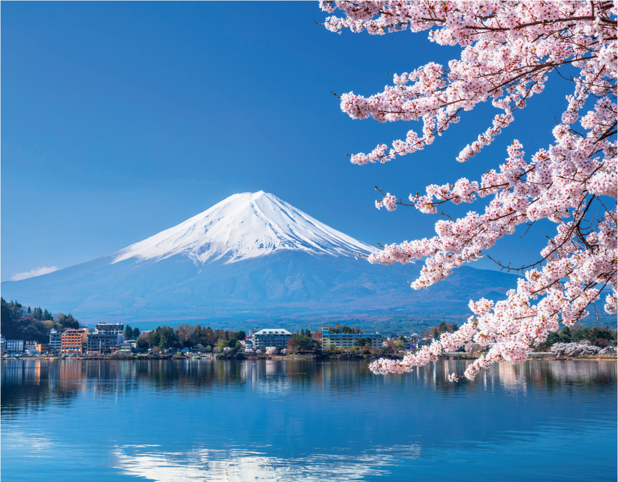
A UNESCO site and “Special Place of Scenic Beauty,” beloved Mount Fuji has drawn visitors for centuries.

Day 2: Arrive Tokyo Upon arrival in Japan’s financial, commercial, and political capital, we transfer to our hotel. As guests’ arrival times may vary, we have no scheduled activities or meals planned.