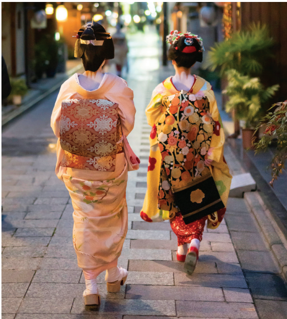
Geishas in traditional dress

Day 12: Kyoto We continue our encounter with Kyoto today. On tap: the important Fushimi Inari shrine, with its trails straddled by some 1,000 red torii gates and Sanjyusangendo Hall (ca. 1266), an