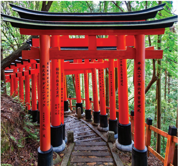
We visit Kyoto's Fushimi Inari shrine on Day 12.

Day 13: Depart for U.S. This morning we travel by motorcoach to the Osaka airport, where we board our return flight to the United States. B