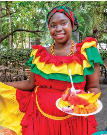
Fruit seller in Cartagena

Day 6: Medellin/Santa Elena We travel today to nearby Santa Elena, a typical – and beautiful – colonial town known for its profusion of flower farms, along with the rich traditions that have accompanied flower growing in the area for generations. We visit a finca (farm), where we learn about the cultivation process and see a variety of plants. After lunch at the farm, we move on to Parque Arví, Santa Elena's stunning nature reserve. Here we board the Metrocable, the iconic gondola system that services some of Medellin's steep hillside neighborhoods. Dinner tonight is on our own in this city known for its robust food and restaurant scene. B,L