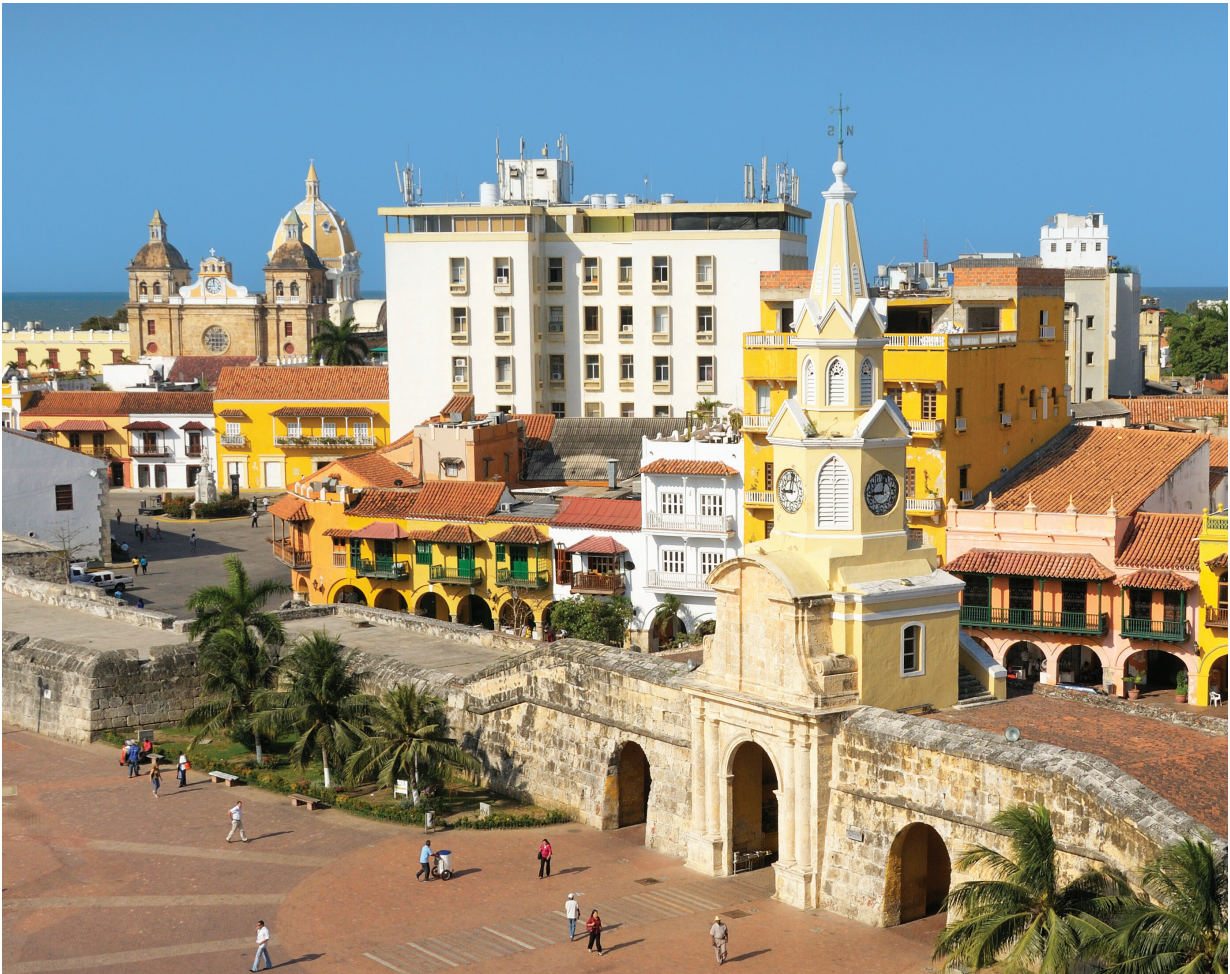
The clock tower rises above the entrance to Cartagena’s historic Walled City.

Day 1: Depart U.S. for Bogota, Colombia We arrive today in the Colombian capital and transfer to our hotel. As guests’ arrival times may vary greatly, we have no group activities or meals planned.