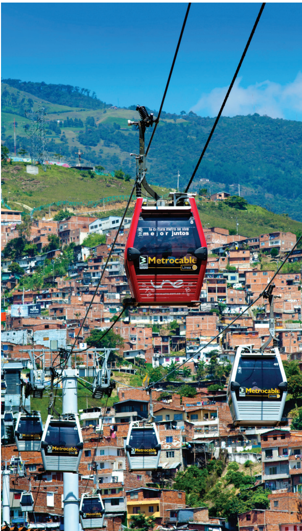
We ride Medellin's Metrocable on Day 6.