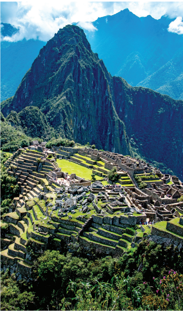
We explore the amazing ruins at Machu Picchu on Days 5 & 6.

Prices include international airfare and all taxes, surcharges, and fees