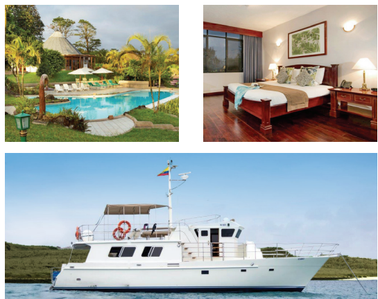
We stay in comfort for four nights in spacious rooms at the Royal Palm Galapagos, set in the lush highlands of Santa Cruz island, and enjoy day cruises aboard the Santa Fe , our privately chartered yacht.

Day 11: North Seymour Island/Bachas Beach This morning we board the Santa Fe , our privately chartered yacht, for North Seymour, a flat, low-lying island with ample opportunities for close encounters with the wildlife on our naturalist-led walk. After lunch, we head back to Santa Cruz island for a nature walk. B,L,D