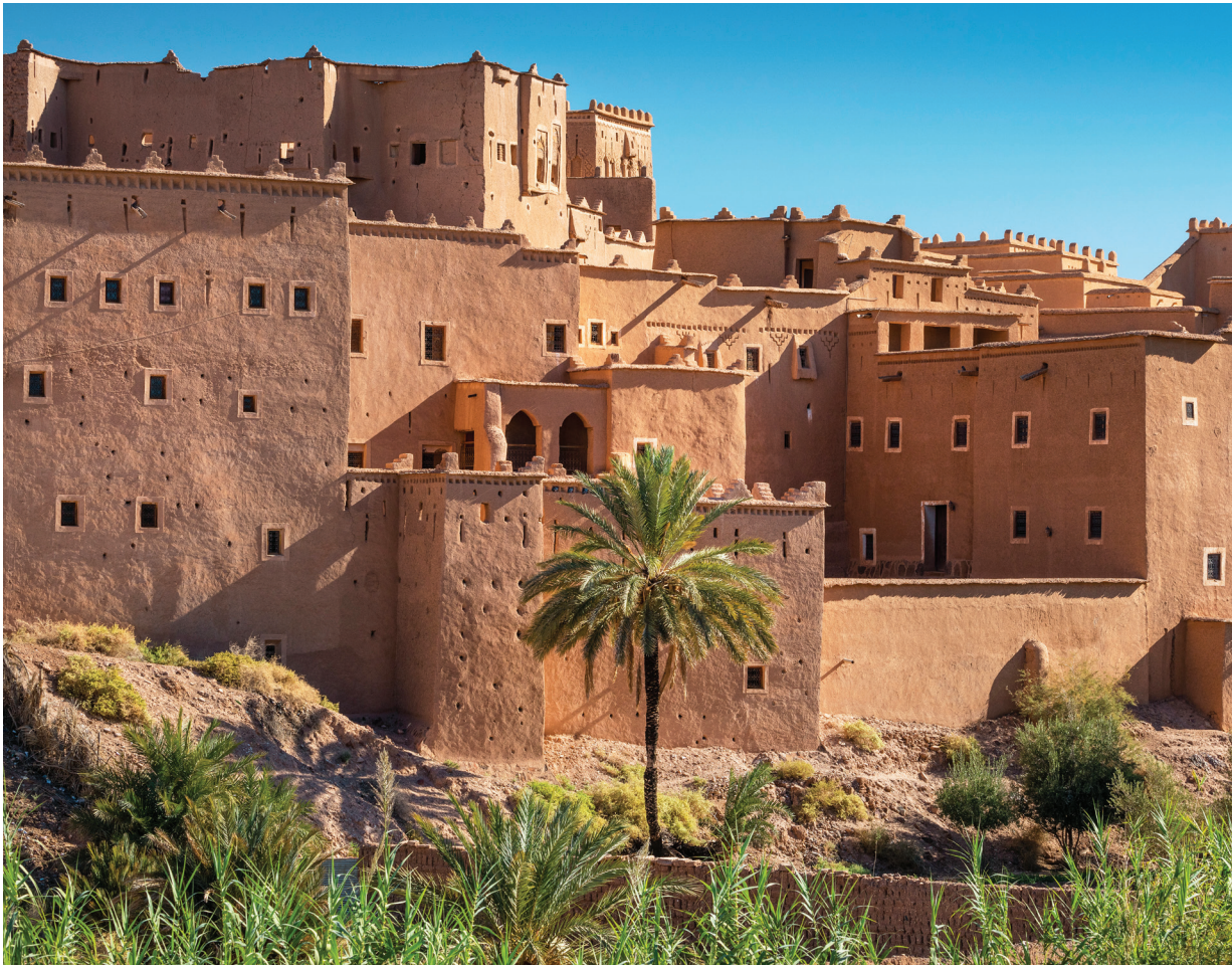
We travel the “Route of a Thousand Kasbahs” ancient caravan trail during our journey.

Day 2: Arrive Rabat We arrive this afternoon in Rabat, where we have time to rest and refresh before dinner together at our hotel. D