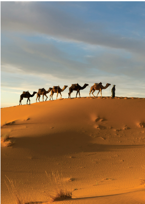
We ride camels in the Sahara on Day 8.

Day 13: Marrakech/Casablanca We leave Marrakech this morning by coach for Casablanca, Morocco's largest and most cosmopolitan city. After a brief orientation tour, we visit the magnificent Hassan II Mosque, Morocco's only functioning mosque open