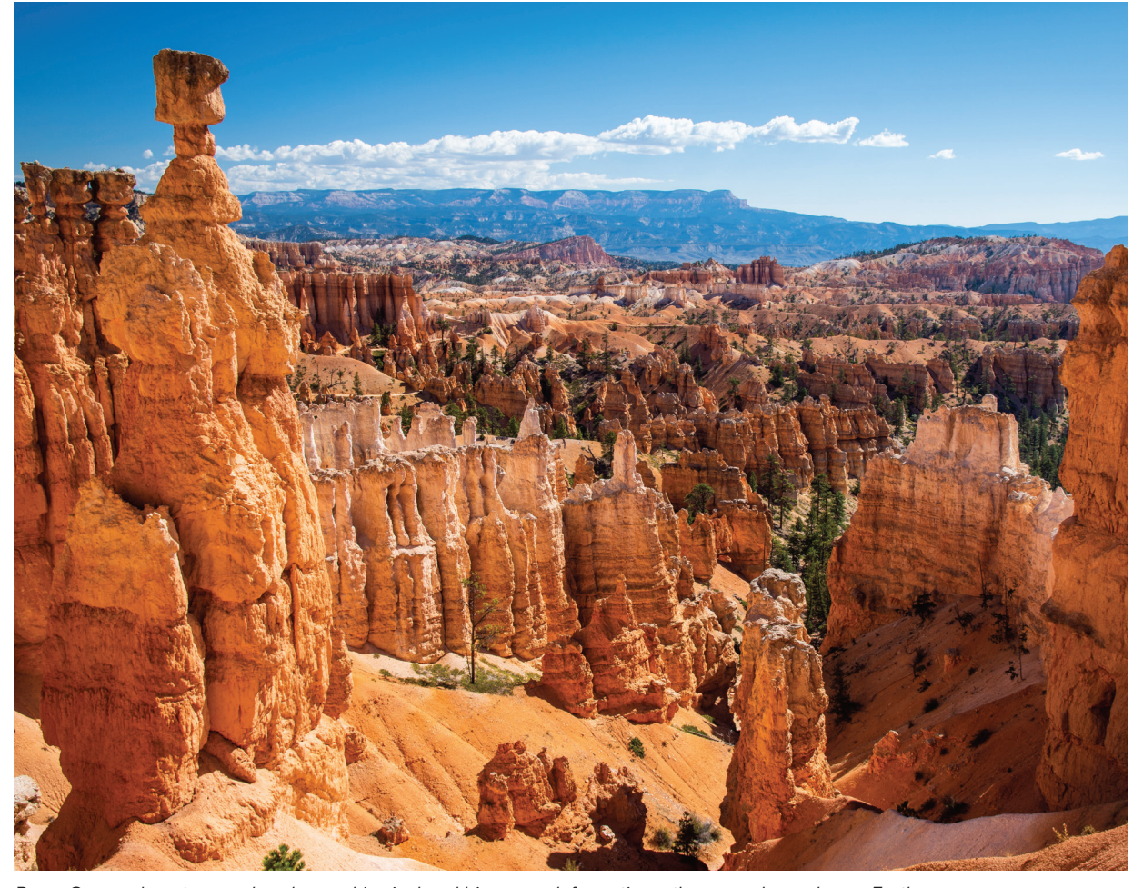
Bryce Canyon boasts more hoodoos-whimsical and bizarre rock formations-than anywhere else on Earth.

Day 1: Depart for Phoenix, Arizona We depart today for Phoenix, Arizona. As guests' arrival times may vary, we have the day at leisure to explore Arizona's capital city as we wish. This afternoon we check in at our hotel, where we enjoy a welcome briefing and dinner together. D