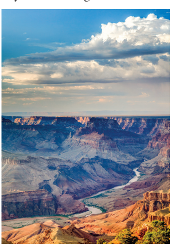
Day 6: Page/Colorado River/Bryce Canyon National Park, Utah Our long, but incredibly scenic, day of travel begins with a rousing motorized rafting

provides hydroelectric power, irrigation, and municipal water supply to nearly 40 million people in the western U.S. Today we'll both motor and drift