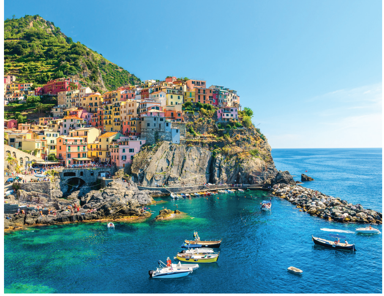
We see Liguria's Cinque Terre, a UNESCO site, by land and sea on Day 7.

Ratings are based on the Hotel & Travel Index, the travel industry standard reference.