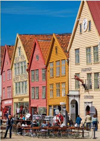
Bergen's historic Bryggen district

Day 10: Bergen We see the highlights of this beautiful city, Norway's second largest, on a morning tour, including Troidhaugen, country home of composer Edvard Grieg; the lively fish market; the colorful 14 th -century Hanseatic merchants' quarter of Bryggen (a UNESCO site); and 16 th -century Bergenhus fortress. The afternoon is free to enjoy Bergen as we wish, with lunch and dinner on our own in this city known for its fish and seafood. B