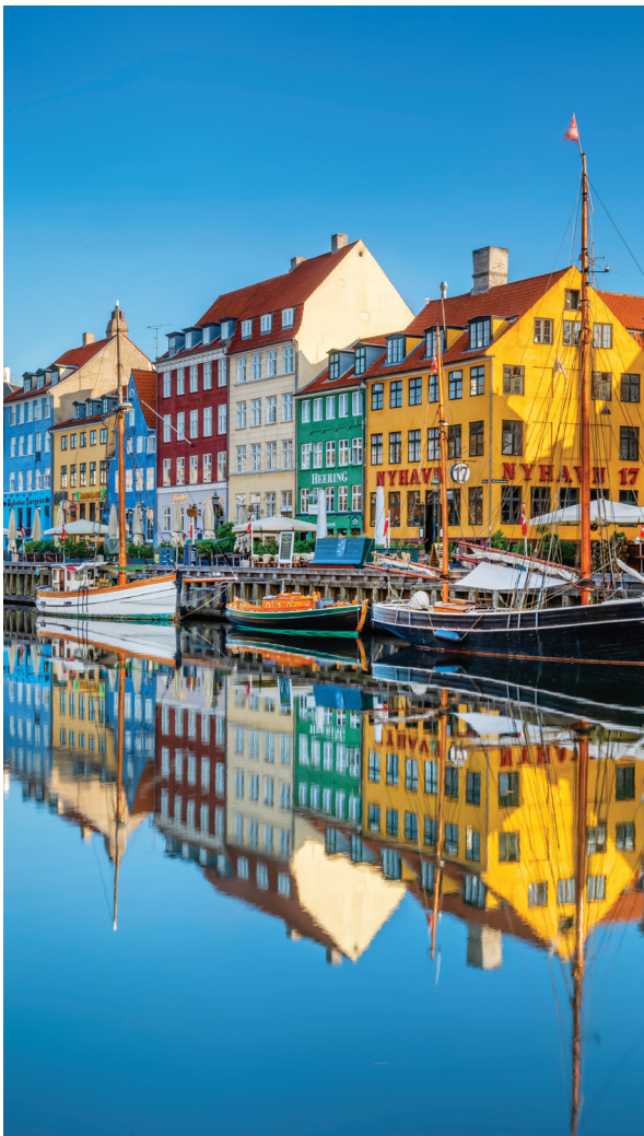
Copenhagen's lively Nyhavn waterfront area

Day 16: Depart for U.S. We transfer to the airport this morning for our return flight to the U.S. B