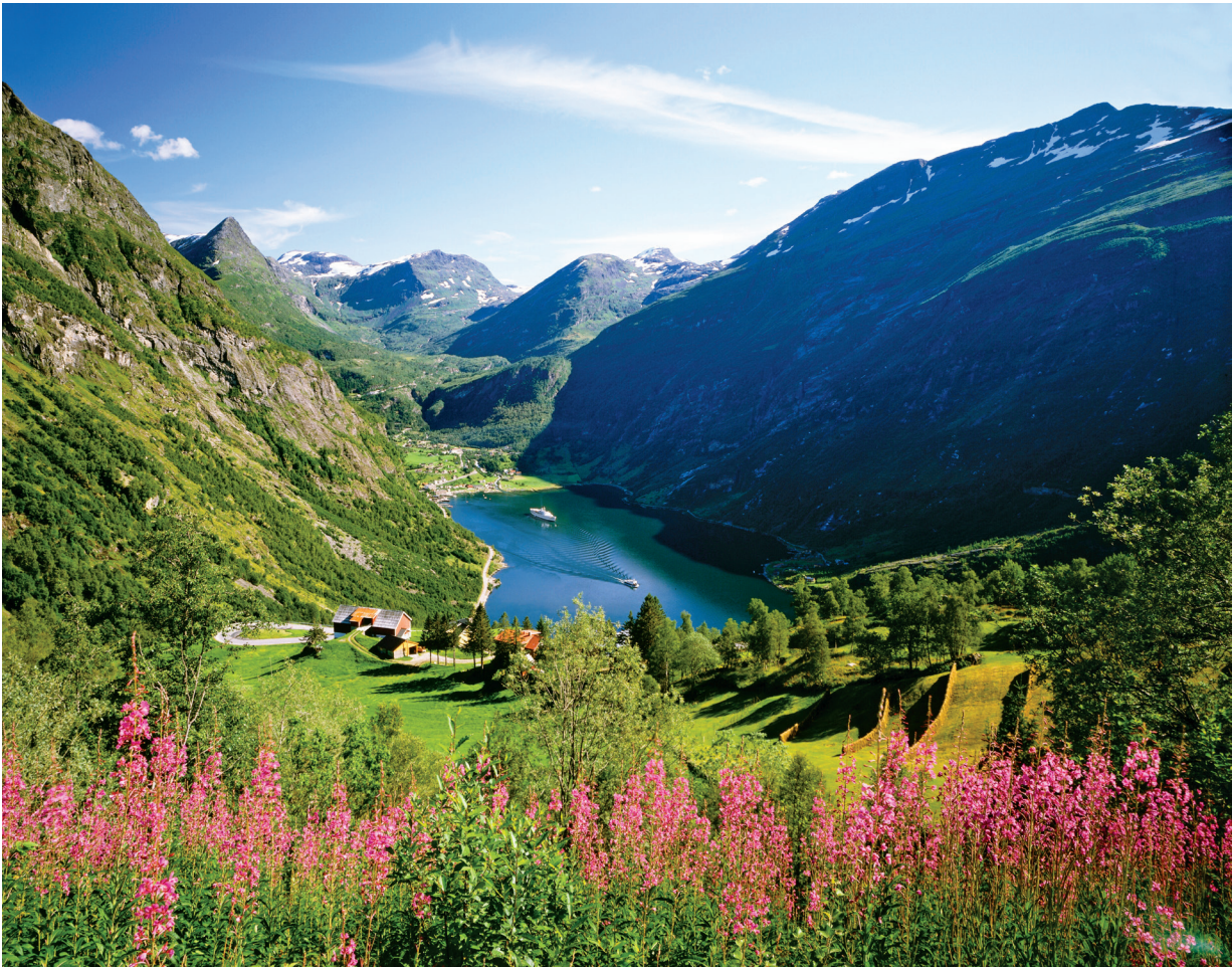
We spend several days enjoying Norway's scenic fjord country, including Geirangerfjord (above), one of Norway's most visited sites.

Day 2: Arrive Copenhagen After arriving in the Danish capital today, this evening we meet our fellow travelers and Odysseys Unlimited Tour Director at a briefing about the journey ahead. Tonight, we enjoy a welcome dinner at festive Tivoli Gardens. D