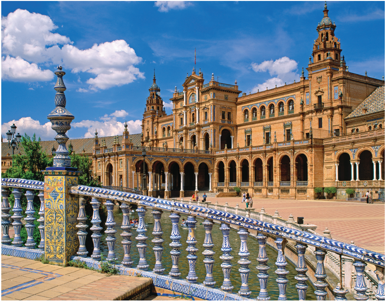
Seville's colorful Plaza de España features tiled fountains, ponds, lush plantings, and grand public spaces.

Ratings are based on the Hotel & Travel Index, the travel industry standard reference.