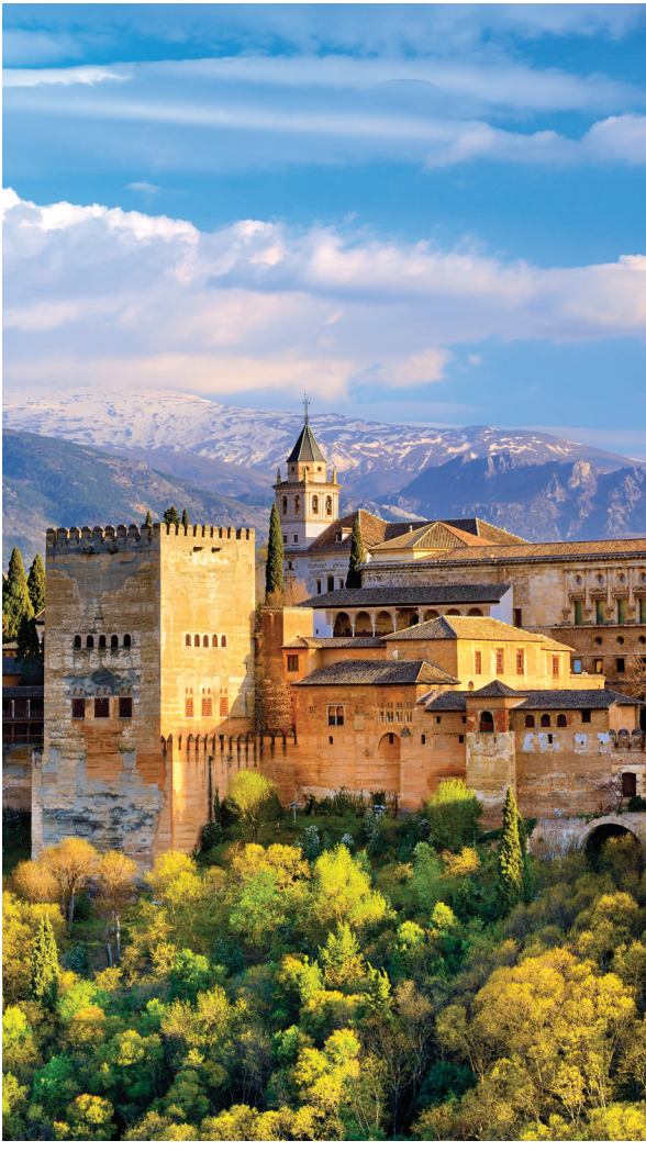
We tour the Alhambra on Day 11.