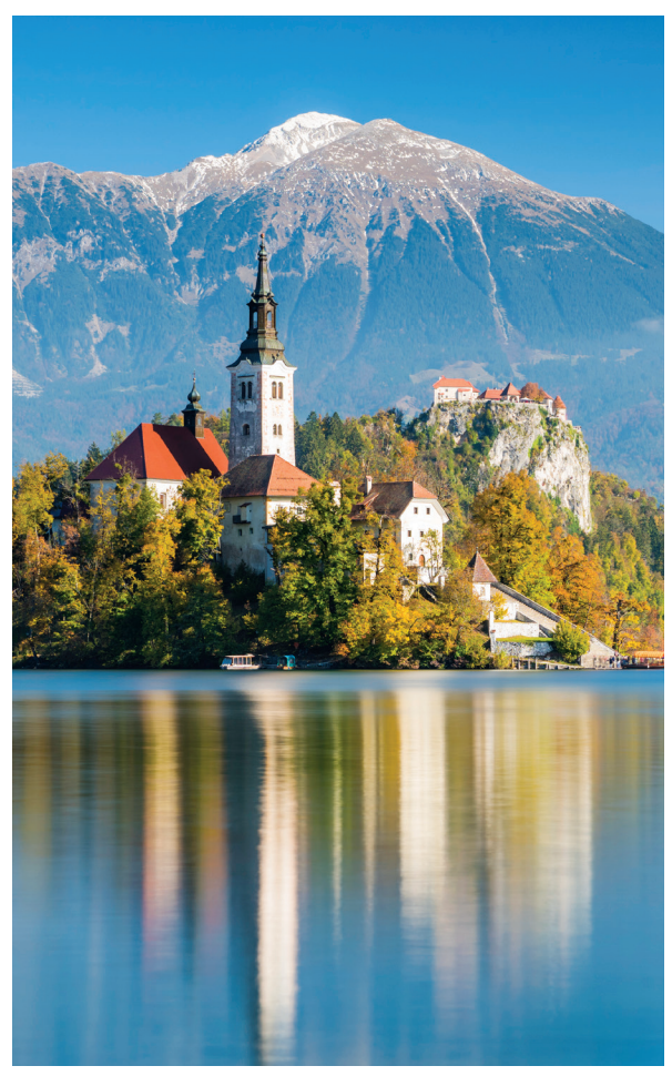
Lovely Lake Bled, surrounded by mountains and forests