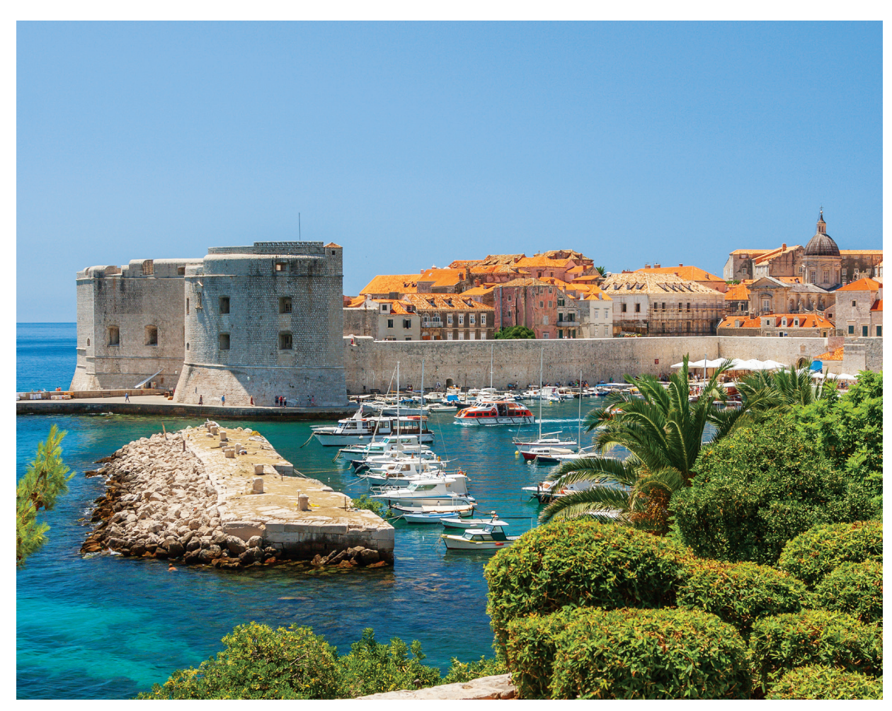
Dubrovnik, "Pearl of the Adriatic," boasts one of the world's best preserved Old Towns, with baroque, Renaissance, and Gothic structures

15 Depart Dubrovnik for U.S. Ratings are based on the Hotel & Travel Index, the travel industry standard reference.