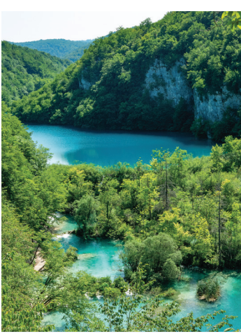
We visit Plitvice Lakes on Day 9.

Day 9: Opatija/Plitvice Lakes/Trogir We travel south today to Plitvice Lakes National Park. Famed for its string of 16 turquoise-colored lakes connected by a series of waterfalls and cascades, separated by distinctive travertine deposits, and surrounded by dense forests, Plitvice counts as one of UNESCO's first