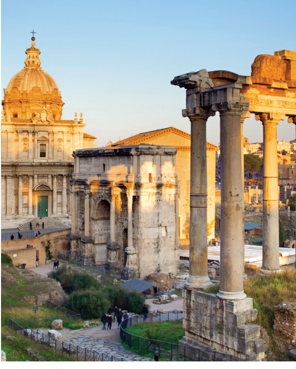
We tour Rome's Forum on Day 6.

Day 15: Venice This morning we take a guided walk through vast St. Mark's Square and surroundings. Our afternoon is free to explore Venice independently; tonight we bid " arrivederci " to Italy and our fellow travelers at a farewell dinner. B , D