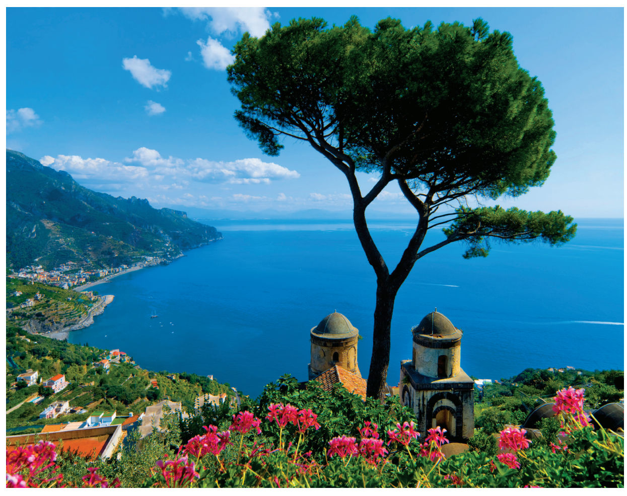
Listed as a UNESCO site, the Amalfi Coast boasts colorful villages and stunning scenery overlooking the Tyrrhenian Sea.

Ratings are based on the Hotel & Travel Index, the travel industry standard reference.