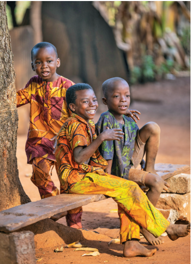
Local children in Benin

Day 9: Akosombo/Volta Region We witness some of Ghana’s remarkable scenic beauty on today’s boat excursion on the Volta River past rolling hills and