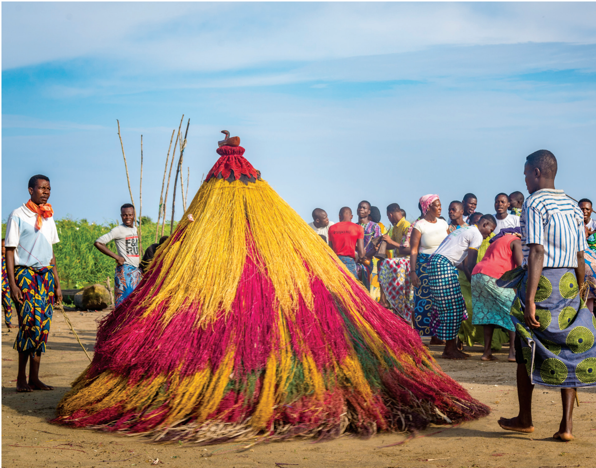
A Zangbeto masked dancer performs at a Vodun (Voodoo) celebration in Benin.