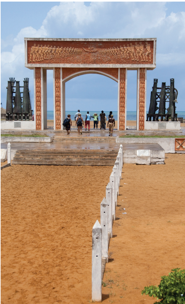
On Day 7, we visit the Door of No Return memorial in Ouidah.

Day 16: Arrive U.S. We arrive in the U.S. today and connect with our return flights home.