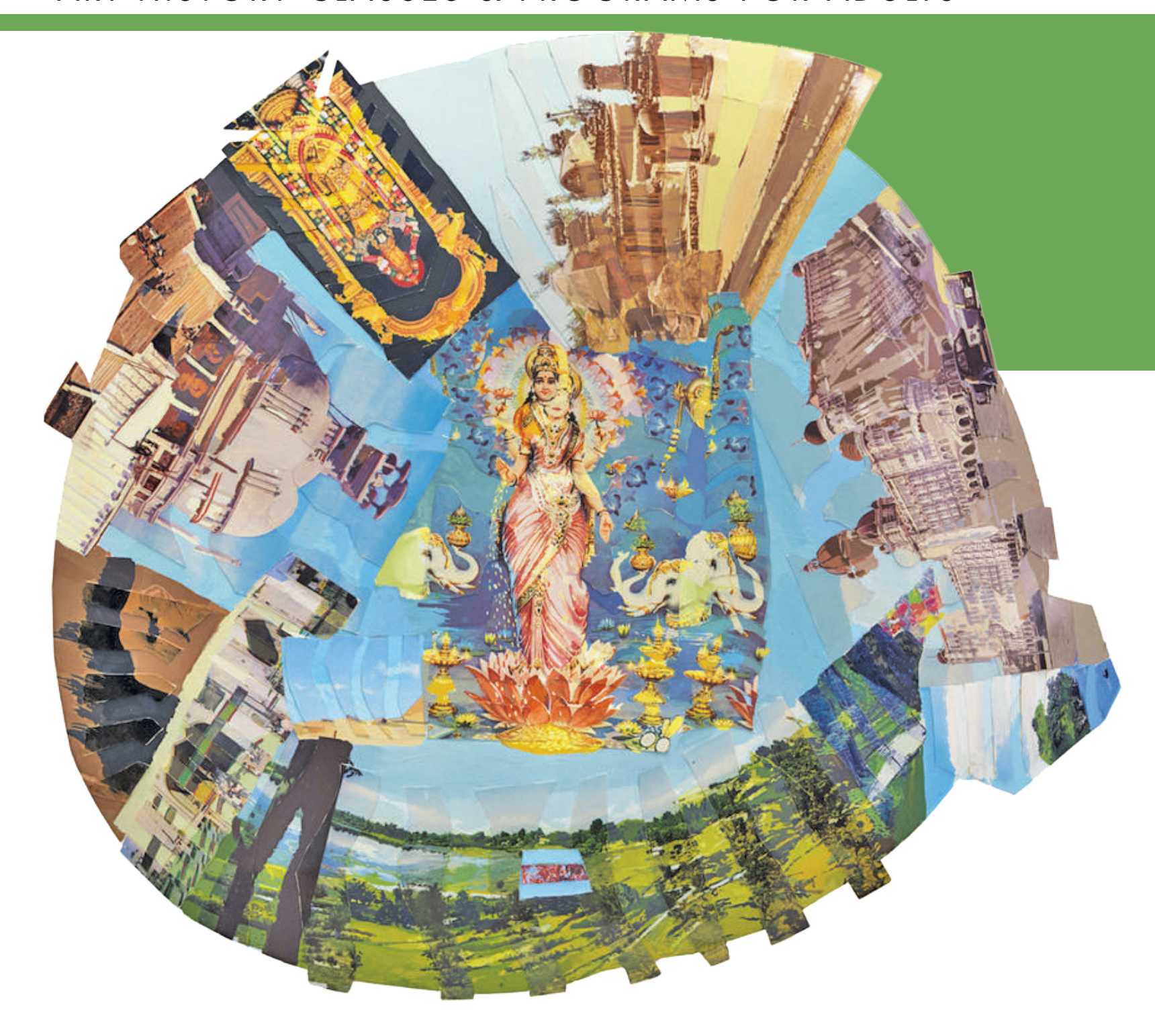
IMAGE Autobiography: India (Lakshmi), 1984, Howardena Pindell (American, born 1943), mixed media on board. Garth Greenan Gallery.

VMFA offers traditional lecturestyle classes as well as one- or two-part introductory courses that include exploration in the best classroom available—the VMFA galleries! Visit VMFA. museum/adults for a complete list of programs.