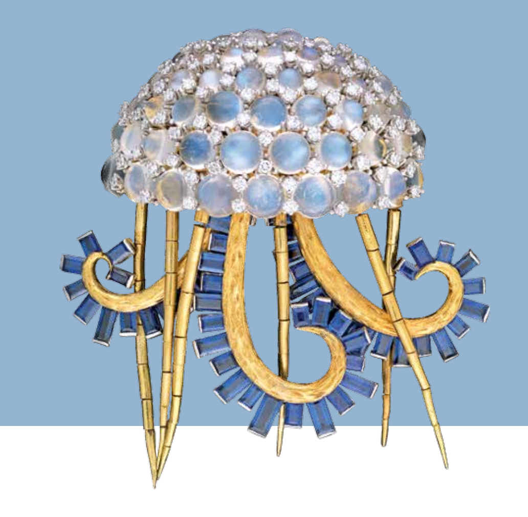
IMAGE Jellyfish (La Méduse) (Brooch), 1960, Jean Schlumberger (French, 1907– 1987), 18 karat gold, platinum, moonstone, diamond, sapphire, Collection of Mrs. Paul Mellon, Virginia Museum of Fine Arts

VMFA offers traditional lecturestyle classes as well as one- or that include exploration in the best classroom available—the VMFA galleries! Visit VMFA. museum/adults for a complete list of programs.