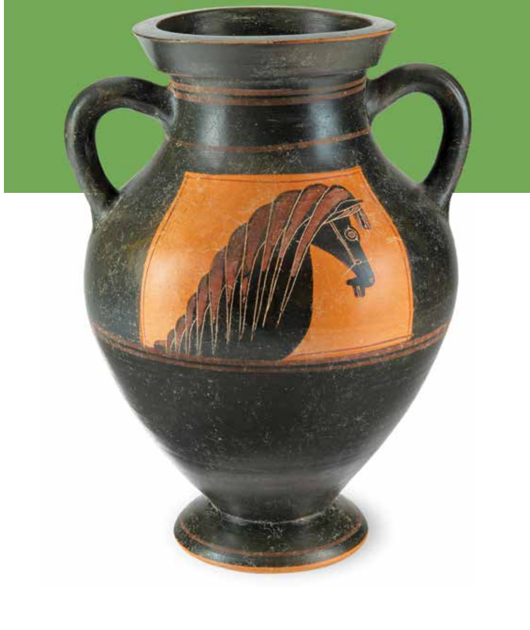
IMAGE Horse-Head Amphora , ca. 580–570 BC, attributed to the Workshop of the Gorgon Painter Greek (Attic), terracotta. Private Collection.

VMFA offers traditional lecture-style classes as well as one- or two-part introductory courses that include exploration in the best classroom available—the VMFA galleries! Visit VMFA.museum/adults for a complete list of programs.