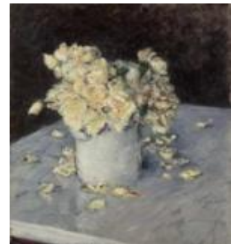
Gustave, Caillebotte, Yellow Roses in a Vase , 1862. Oil on canvas; 53.34 x 46.355 cm. Dallas Museum of Art.