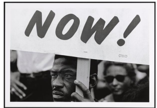
Washington D.C., 1963, printed 2013, gelatin silver print. Aldine S. Hartman Endowment Fund.