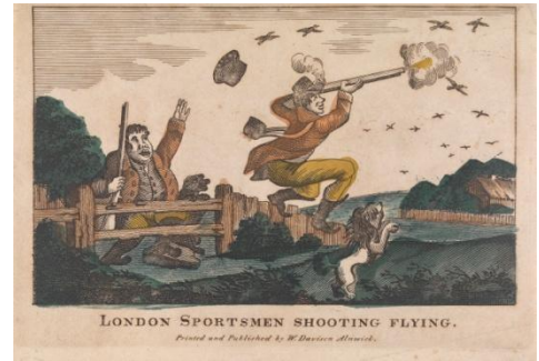
Isaac Cruikshank (Scottish, 1756–1811) London Sportsmen Shooting Flying . Hand-colored etching on thin wove paper. Paul Mellon Collection.

This exhibition sheds new light on a common but often overlooked aspect of British art—the Sporting Print. Featuring 120 works drawn primarily from VMFA’s Paul Mellon Collection, Catching Sight reveals the aesthetic sophistication and accomplishments of the genre. Highly sought-after during the 18th and 19th centuries, these prints endure as symbols of English culture. This exhibition takes an innovative approach to the subject by examining the works from both art-historical and aesthetic perspectives rather than simply as documents of the history of sport and rural culture. It is curated by Dr. Mitchell Merling, Paul Mellon Curator and Head of European Art.