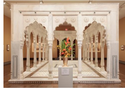
Indian, Rajasthan, Bharatpur region, Pavilion , 19th century. White marble with black schist and brown mottled marble inlays. Floral Interpretation by Judy Hodges and Andrea Metts, Thomas Jefferson Garden Club, New Canton.

Flowers and fine art unite for an exhibition of beauty and creativity. Floral designers from more than 50 garden club chapters across Virginia interpret masterworks in VMFA's collection with floral arrangements throughout the galleries. Lectures by prominent floral arrangers, an evening gala, lunches, Sunday brunch in bloom, a fashion show, floral tea, hands-on flower arranging workshop, and other events will take place throughout the four-day exhibition.