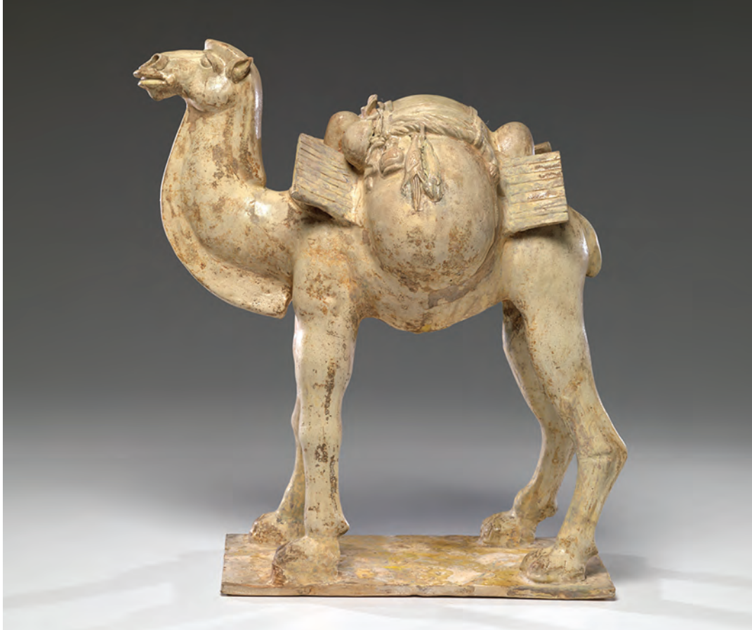
Bactrian Camel , 7th century Chinese Tang Dynasty (618–906) Glazed earthenware Adolph D. and Wilkins C. Williams Fund, 51.12.2

This sculpture was most likely found in the tomb of a very important person. It represents a Bactrian camel with two humps. This type of camel was used to transport goods across deserts and along the Silk Road, a series of more than 4,000 miles of trade routes that linked China with parts of Central Asia, the Mediterranean, Africa, Europe, and South Asia. Camels were an important part of daily life in ancient China. They could carry a great deal of weight and survive the weather in the Gobi desert, where it could be very hot during the day and very cold at night. Camels are built for long, dry journeys. Their humps store fat, which they use for energy when food is short. A camel's stomach lining is specially built for water storage. The length of time camels can go without a drink depends on their travel speed and the weight of the load they're carrying. They can last about six to ten days if traveling is slow and easy. Their long eyelashes keep the sand out of their eyes. Their big feet prevent them from sinking in the sand.