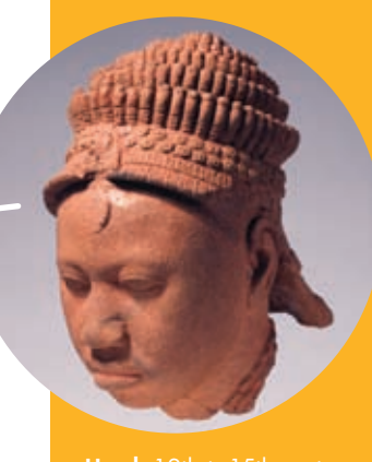
read, 12th to 15th century, terracotta. Found during archaelogical excavations at Ita Yemoo, Ife, in 1958. National Commission of Museums and Monuments, Nigeria, 79.R.7