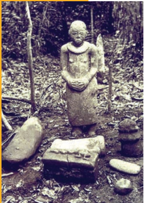
All of the objects in this section were found in sacred groves, parts of the forest near Ife where people go to pray or leave offerings to their gods, their ancestors, or those who are sick or dying.

Most of these stone objects are carved in the shape of humans or animals. They once stood on or near altars, holy places where people can contact spirits from the other world. The Yoruba people honor certain animals for their beauty, strength, or special powers.