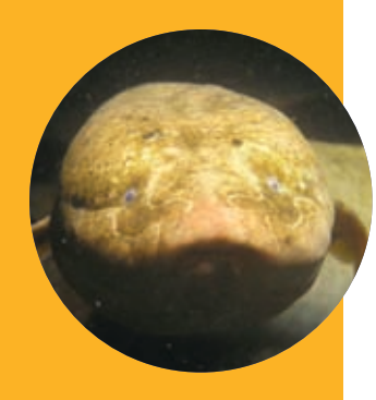
The African Mudfish and the Nile Crocodile