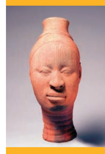
Head, 12th to 15th century, terracotta. Discovered in 1967 (by young twin boys) at Odo Ogbe Street, Ife. National Commission of Museums and Monuments, Nigeria, 73.2.71 (i)

For a fun sketching activity, go to www.VMFA.museum and click on "Learn" and "Educators."