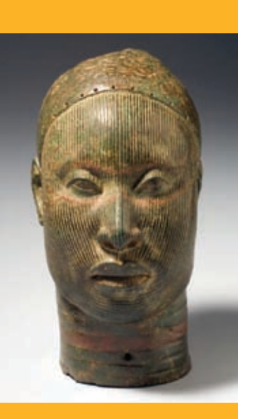
Head, 14th to early 15th century, copper alloy. Excavated at Wunmonije Compound. National Commission for Museums and Monuments, Nigeria, Ife 6