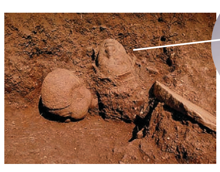
Ita Yemoo Grove Site , showing objects partially uncovered. Photo by Frank Willet, 1958.